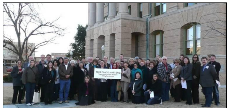
New staff and board members, Georgetown training, January 2011

Other very successful trainings during the year were held in Paris, Denton and in Nacogdoches for the Texas Downtown Association/Texas Main Street Annual Conference. There were close to 300 participants in these various events, greatly helping to further preservation awareness and education. The Denton training also in-