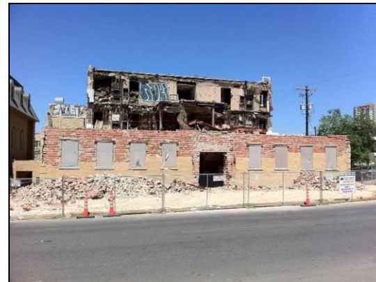
A recent demolition of an historic apartment building in Austin

Yet another factor to consider with old buildings is that they simply exist . They already represent an investment in time and materials and they usually require nothing more than regular maintenance to continue to serve a role in the community. Their design and construction required skills and talents that are difficult or impossible to replicate. Preservation eliminates waste of construction materials and other resources. Rehabilitation means reduced demolition and lessened impact upon landfill space. Should a town start to lose its old buildings to demolition, not only would the value of the materials, energy resources, and labor used to design, build, and maintain the structure be lost, but a piece of the town’s soul would be lost as well. When an old building is demolished it is gone forever. Photographs, drawings, and written accounts