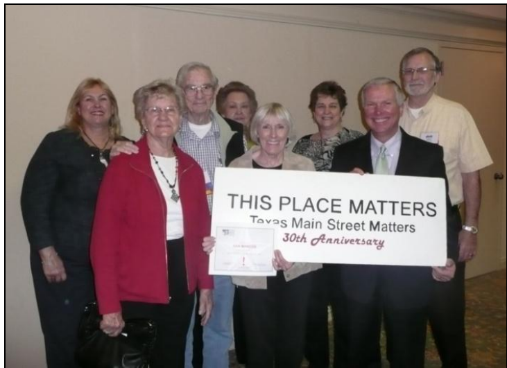
San Marcos Main Street board members and staff celebrate their most recent National Recognition award with THC staff. The San Marcos program is one of four in Texas to have received it each year since 1999.

Main Street is based upon an incremental approach. So it is important to look at Main Street economic progress over time through reinvestment to show that having a strategic and preservation-based local revitalization effort pays off.