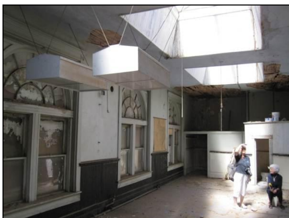
A cotton-sorting room on the upper floor of a late 19 th Century building in Quanah; notice the thick walls, large open space, tall windows, and skylights.

In 2011, Uvalde, Vernon and Kingsville were all accepted as officially designated programs. Each community spent the year building