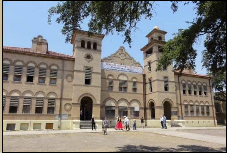
The H.M. King High School in Kingsville