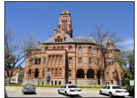
The Ellis County Courthouse in Waxahatchie, architect J. Riely Gordon, 1897

When these prominent building types were built in the formative stages of a town's growth, people who had very limited opportunity for travel or advanced education