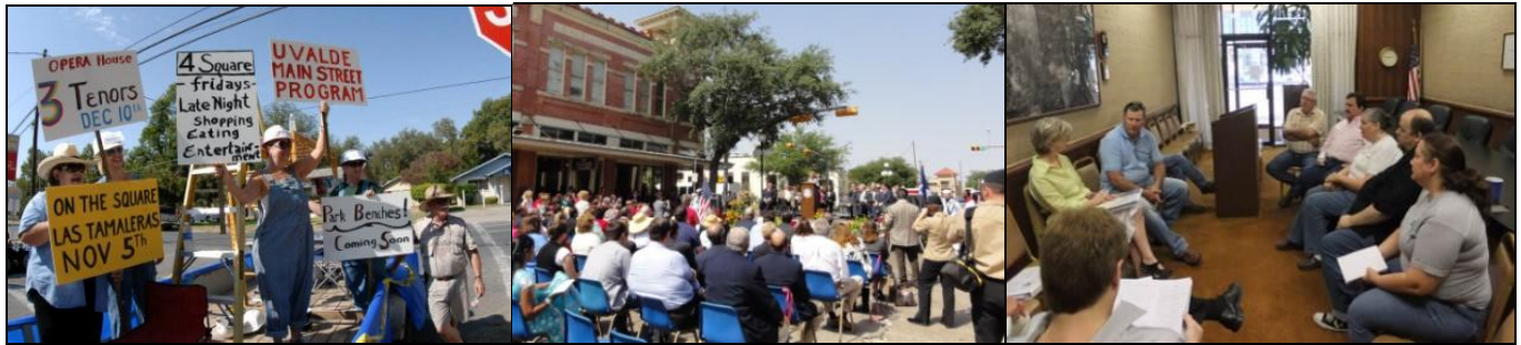
Setting the stage for future success: Uvalde board members on a parade float touting Main Street efforts (left), the Kingsville First Lady's Tour (center), and the Vernon resource team (right).

up their Main Street foundation to set the stages for future progress.