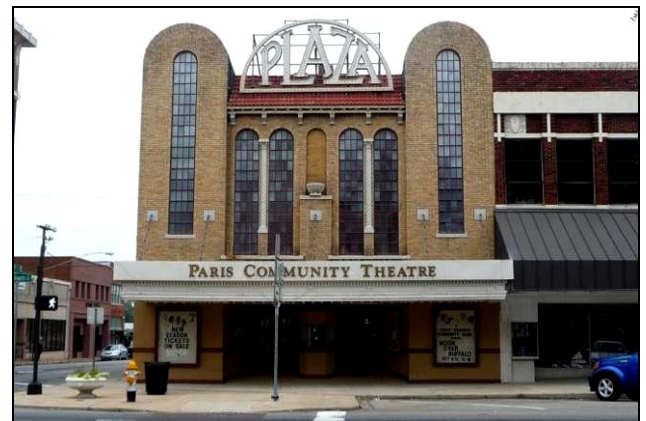
The Plaza Theater in Paris

were suddenly exposed to state-of-the-art construction methods and the talents of state, regional, or nationally prominent architects and designers. As a result, a remote town could receive its first taste of Gothic Revival, Neoclassical, Renaissance Revival, Richardsonian Romanesque, French Second Empire, or, later on, Art Deco and Streamline Moderne. It is difficult for a modern-day person to imagine what a tremendous impact these buildings made when they were first constructed.