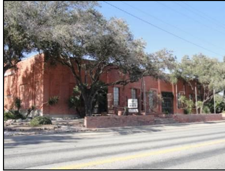
The King Ranch Museum in Kingsville, a 2011 Texas Main Street City

Old buildings and towns attract people. While some folks enjoy visiting new resorts and theme parks, many others flock to historic sites that have buildings, streets, parks, and vistas that evoke a deeper reaction, a bond to the past.