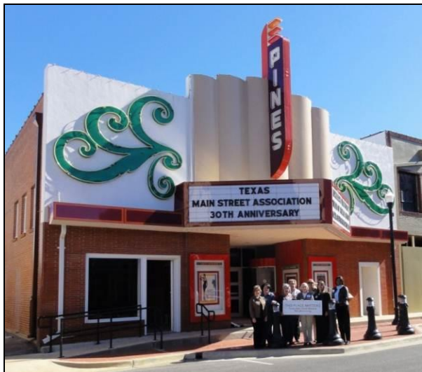
Just one more...the last This Place Matters anniversary picture for 2011, taken in Lufkin just after the annual conference in nearby Nacogdoches.