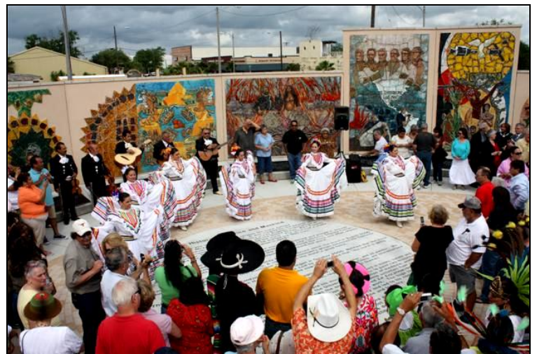
The April 2010 dedication of the monumental History of Mexico and Mankind Mural

Finally, managers will see how downtown Harlingen uses larger-than-life-size murals to portray aspects of our community's history