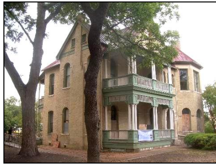
Project house in HemisFair Park, San Antonio, TX

original wood windows, I decided to take a two-day class on window repair being offered by the City of San Antonio's Historic Preservation Office. The class was hands-on with participants actually working to repair the wood windows in a beautiful historic house on the HemisFair grounds. It was not glamorous work. Within the first hour, the group donned gloves and masks and got to work taking apart the windows, globbing on solvents, and scraping paint. Most of the windows were painted shut with layers upon layers of paint, much of which contained lead. On the bright side, these were gorgeous floor-to-ceiling arched windows made of old growth wood and really all they needed was a little TLC.