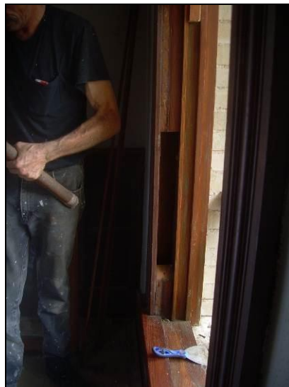
A look at the 'hidden' door that holds the cast iron counterweights (participant is seen holding weight)

The group left this two-day workshop energized—excited about the value of the historic wood windows and confident in our (and any willing person's) ability to repair them. These windows were made to be