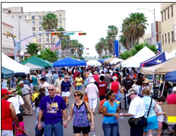
Thousands attend Jackson Street Market Days the first Saturday of every month.

In April 2011, a former 1927 hotel reopened downtown as the stylish