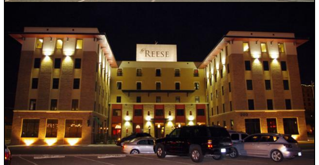
Top: Postcard view of the 1927 Reese-Wil-Mond Hotel. Middle: 2005 photo of the vacant landmark hotel. Bottom: August 2011 evening photo of the renovated Reese Plaza which is now mixed-use development.