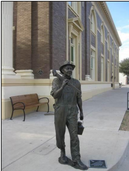
Quittin' Time bronze commemorating Corsicana's oilfield workers from a bygone era installed in downtown

Following the presentation, Willson conducted a windshield assessment