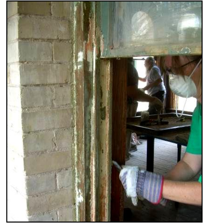
Scraping layers of old paint

By the end of the first day—this humble group, a mix of students, contractors, homeowners, and design professionals—was off to a good start repairing about eight of the home's 30 plus windows. All the windows had been taken apart by carefully removing the lower window sashes from the frames and discarding broken glass. We had carefully removed the layers of paint and applied linseed oil to protect the now bare wood. The more than 100-year-old wood was gleaming once again! The group was tired, but hopeful that we had made a good start and would be able to complete the project the next day.