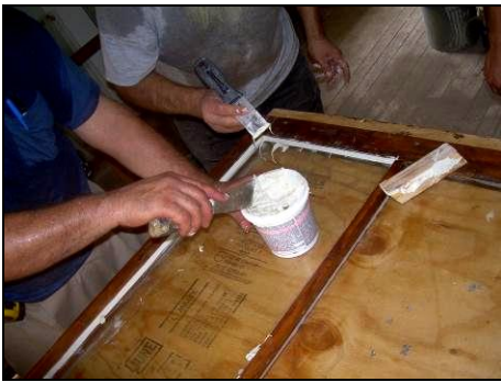
Replacing broken glass and reglazing

This, combined with the current methods of tree growing and harvesting that encourages rapid tree growth, makes this old-growth wood that was used in most old windows literally priceless.