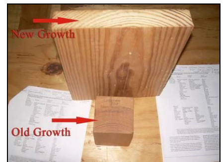
Showing the difference in rings in new growth and old growth wood

The next day began on a high note with a visit from a wood expert from a local lumber store, Alamo Hardwoods. He explained the characteristics of many different species of wood, and his thoughts on the immense quality of the old growth wood used in historic wood windows. Most interesting to me, he explained just exactly what “old-growth wood” is. When new trees grow in a natural forest, the older trees have already formed a dense canopy overhead, making the new trees compete for light and nutrients. This results in the new trees growing much slower, forming tighter growth rings, which makes for an overall denser wood. This denser wood is stronger, therefore less prone to rot. Most of the virgin forests that contained this old growth wood were cleared many years ago, and the ones that were not cleared are now protected.