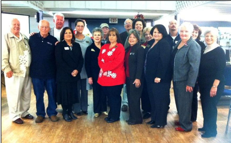
Canton celebrates 10 years of Main Street with the Main Street board, the local community, city and county officials.

More than six million pounds of trash was collected along with 1.2 million pounds of electronics! For more information on how your community can be involved, see www.dontmesswithtexas.org .