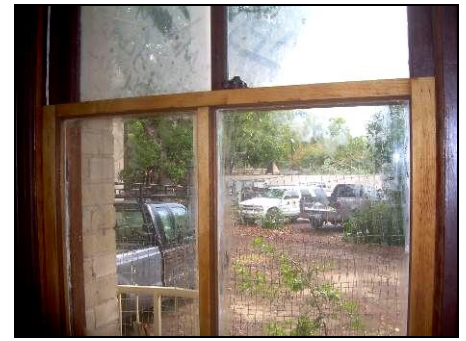
The restored, operable lower sashes

repaired! Seeing and experiencing the craftsmanship and quality of these windows enabled everyone to feel an emotional connection to them. Were any of the group to walk by this house, years in the future, and see these windows being thoughtlessly ripped out and discarded in a landfill only to be replaced with shiny new replacements, we would be as heartbroken as if we had lost an old friend. The metal and vinyl-clad replacement windows have no soul. Replacement windows are far from being