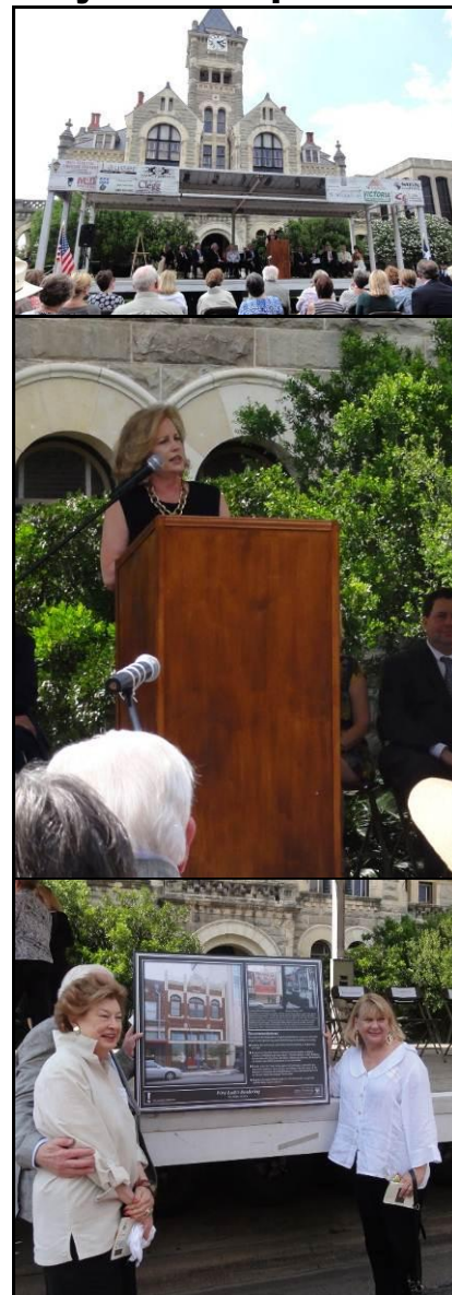
Victoria First Lady's Event