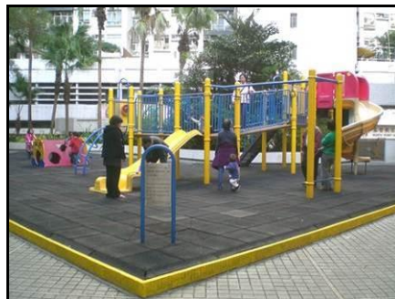
Build playgrounds near populated areas or within view of nearby windows.

Natural surveillance increases visibility into and out of sites and buildings. Greater visibility discourages potential offenders and gives legitimate users a greater sense of security. Natural surveillance strategies can include: