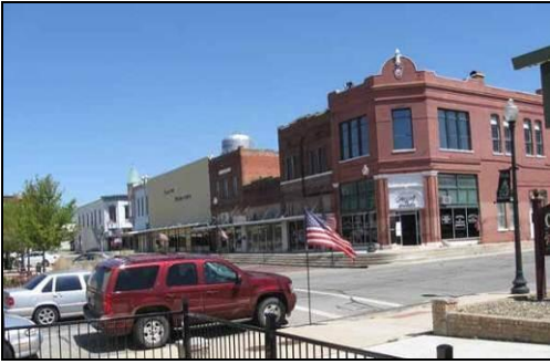
The Red River County Chamber/Main Street office is in the heart of downtown.

Relay for Life, Farmer's Market, and more.