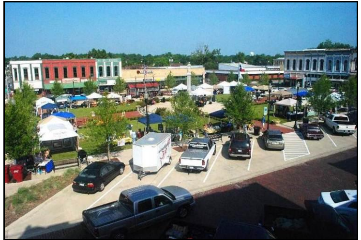
Downtown Clarksville is a gathering place for social events and festivals.

Clarksville became a Main Street City in 2003. By 2004 the city had received several grants to make needed enhancements and improvements, including new sidewalks and curbs, period lighting and street furniture, and the enlarging and landscaping of the monument area on the square.