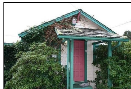
Trim overgrown bushes that could conceal criminal activity.