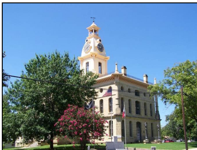
The restored Red River County Courthouse, circa 1885, located a few blocks from the square, contributed to the revitalization of downtown.

The Martha, David and Bagby Lennox Foundation provided a very generous grant to assist in efforts to revitalize the downtown square and improve the economic climate of the area. The city also received two separate Texas Capital Fund Main Street grants and a grant from Texas Depart-