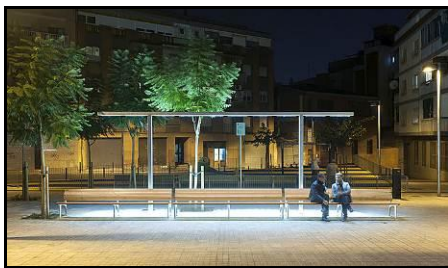
Plazas, bus stops, and building entrances should be well lit, with no obstructing bushes or other elements.