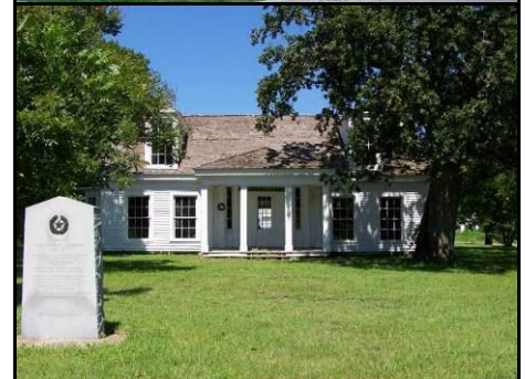
Clarksville's historic Lennox House (top), jail museum (middle), and DeMorse house (bottom) are but a few of the reasons heritage tourists come to downtown Clarksville.