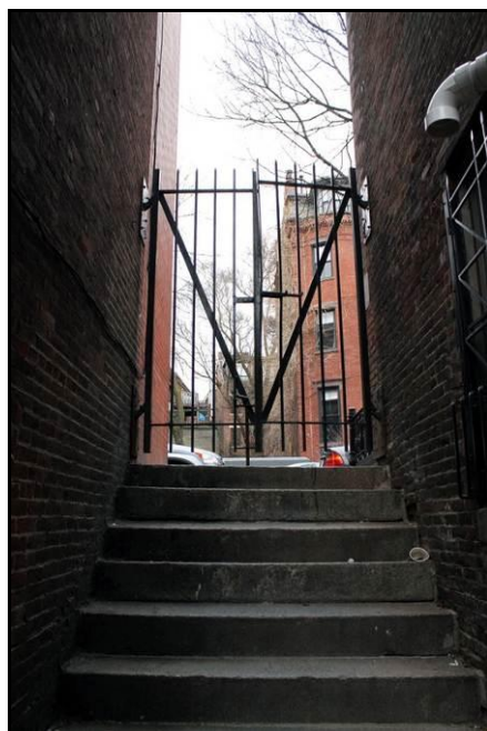
Close off alleys and restrict access to rear yards.