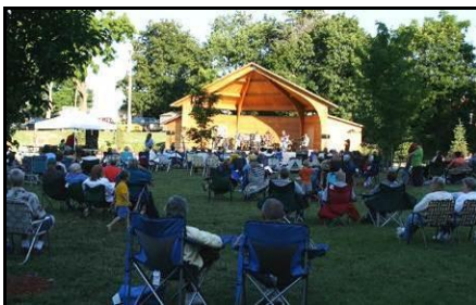
Farmer's markets, art festivals, and concerts in the park can reintroduce legitimate users to streets and parks.

Activity support is a related objective that aims to increase the use of an area, thereby increasing its natural surveillance. Activity support strategies can include zoning for mixed use to ensure pedestrian activity at all times of day, and creating shared parking lots so that office parking lots may be used by restaurants in the evening. Legitimate use of spaces can be encouraged by placing safe activities such as farmer's markets in previously unsafe parks or parking lots, extending the hours of skate parks and basketball courts, or scheduling regular events such as summer concert series.