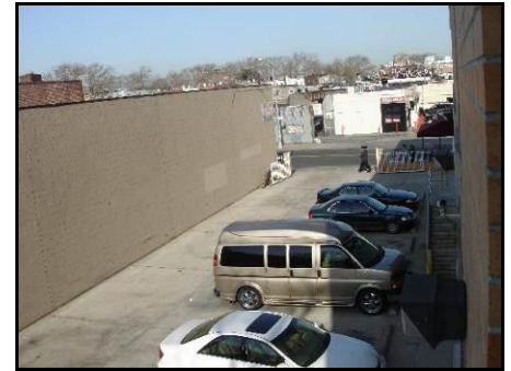
Avoid blind spots. Parking areas and other spaces should have windows opening onto them.