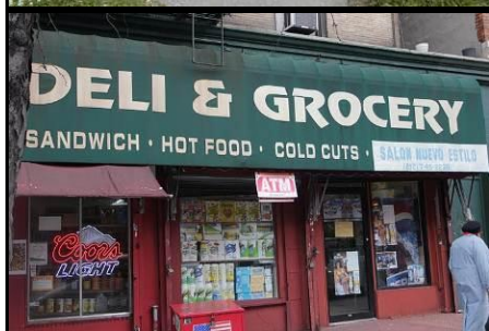
(top) Avoid pedestrian tunnels; where possible, build pedestrian overpasses instead.