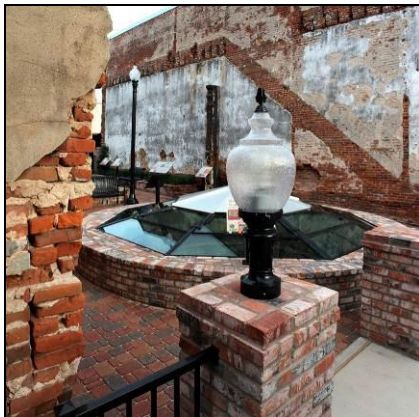
Historic cistern in Toubin Park dedicated in downtown Brenham.

With the economy of recent years in the doldrums, the city has had limited funding available for specific Main Street projects so it has been community support for the downtown revitalization process