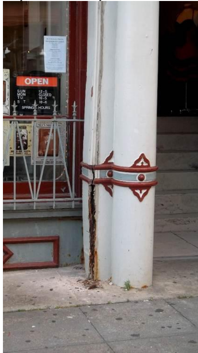
Fig 5 Rust has 'bloomed' in this structural cast iron element (jill, trim as needed to fit)

remove the rust and repair the cast iron. Rust has 7-10 times the volume of the undamaged metal, therefore it can be said that rust 'blooms,' expanding the cast iron (Fig 4 & 5). Though you may think that you are looking at a significant amount of rusted metal, in reality, rust in normal conditions rarely exceeds 5-25 percent of the total cast iron material. When the face or exterior surface of a material, usually plaster or stucco, begins to crack due to a rusting cast iron element enclosed inside, this is known as 'rust jacking.' Keeping a careful eye out for this issue can help identify potential issues with cast iron that may not be readily visible.