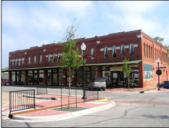
As Brenham’s new billboard boasts, “Expect to be charmed” in downtown Brenham...at the historic Ant Street Inn (above) hosting the Main Street Summer Workshop and in all of downtown.

group met with community leaders to gather support to fund the plan. It was because of the determination of Main Street supporters that funding was made available, the planning process took place, and adoption of the plan is expected in June.