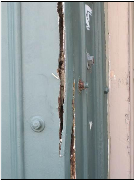
Fig 4 Rust has split the surface of this cast iron column

Architecture of Galveston to their 11 Most Endangered List in 2009. As a direct result of this listing, the Galveston Historical Foundation received a grant from the National Endowment for the Arts to host a symposium on the manufacture and maintenance of cast iron. When the designers here at the Texas Main Street Center (TMSC) heard about this symposium we were very excited to go and learn more.