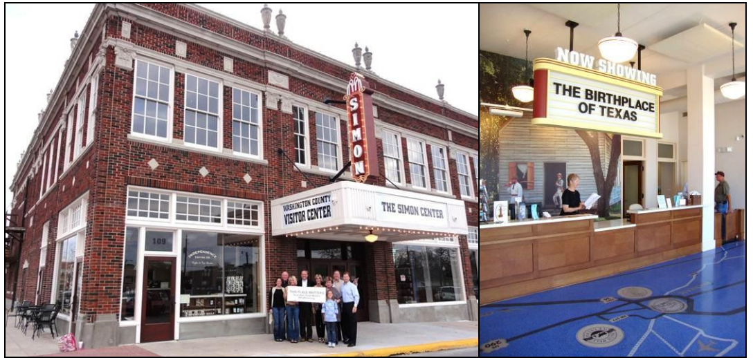
The historic Simon Theater (left) houses a coffee shop and the Washington County Visitor Center (right). Notice the map on the floor of the Visitor Center.

that has enabled us to accomplish several things that otherwise would have had to wait for better economic times.