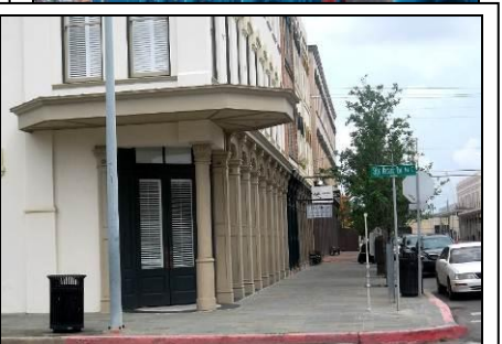
Fig 1 A row of cast iron buildings in the Strand/Mechanic National Historic District

To bring awareness to this issue, the National Trust for Historic Preservation named the Cast Iron