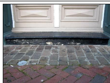
Fig 6 The cast iron threshold is being bowed upward, likely by rust caused by contact with the brick sidewalk

Once a rust issue is identified, your object becomes finding a qualified