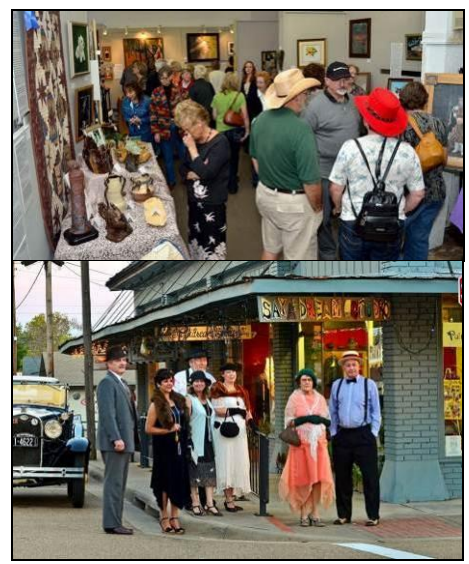
(top) Winnsboro Center for the Arts Women in the Arts exhibit. (bottom) 3rd Friday Art Walk with Steampunk as the theme.