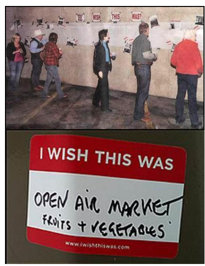
Pictures were posted along with the question "What do you wish this was?" at this community Wine Share event in Kerrville, which gathered 140 ideas for vacant downtown buildings.

Utilizing the "I wish this was" project (see <u>www.iwishthiswas.com</u>), originally used after Hurricane Katrina in New Orleans to gather input on what locals wanted to see in their vacant stores, Kerrville held its own version of this event for downtown. Ideas poured in at the downtown First Friday Wine Share