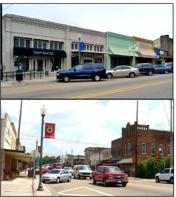
Downtown Winnsboro

More notable achievements since that first year include: