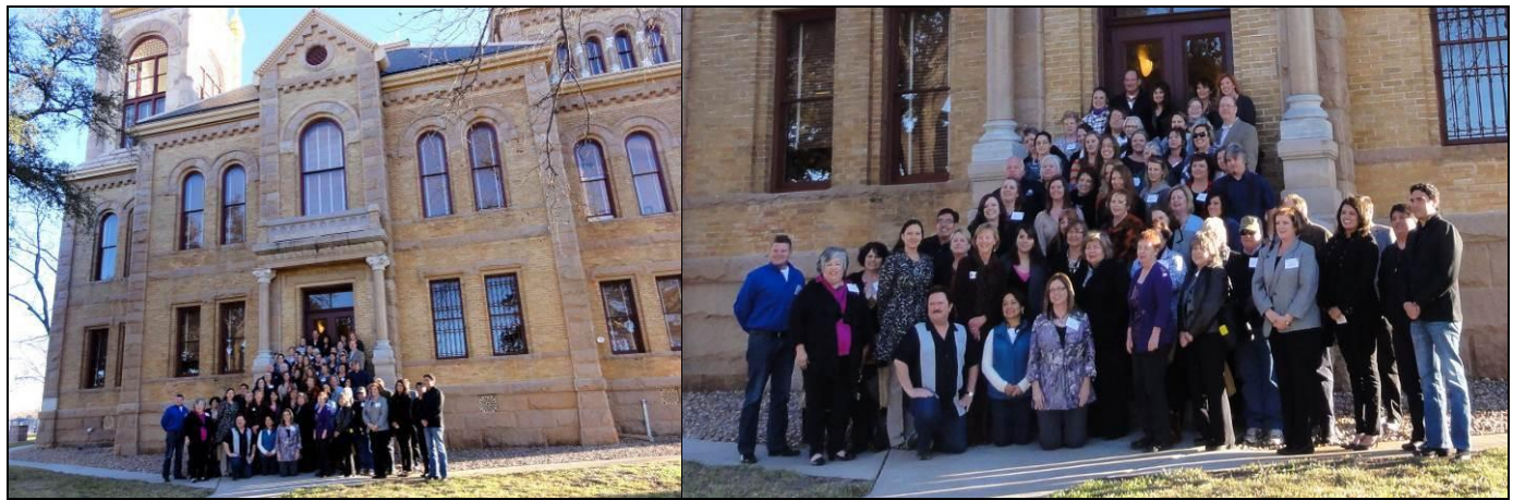
Texas Main Street Managers attending winter training Jan. 29-Feb. 1 in front of the Llano County Courthouse

In 2012, more than 2,017 Great American Clean-up events were