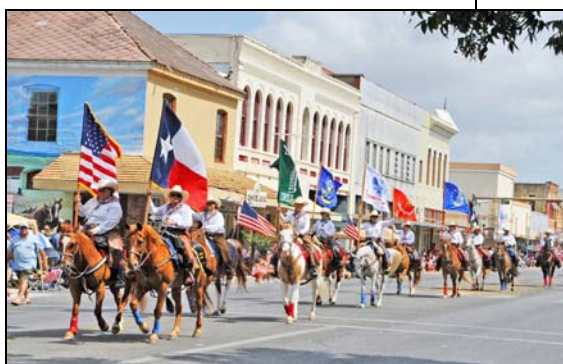
Engaging events bring people to your downtown.

Listening, celebrating the past, and fixing little problems was what laid the foundation for our early revitalization success. Working with a meager budget, the new Main Street board set realistic short-term goals based on the Four-point Approach™.