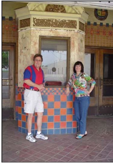
Seguin's historic Texas Theatre is the location for Main Street professional development being held in January 2014.

where your town is in the revitalization process, the Four-Point Approach™ is pretty much foolproof. It even works for Foreign Yankees!