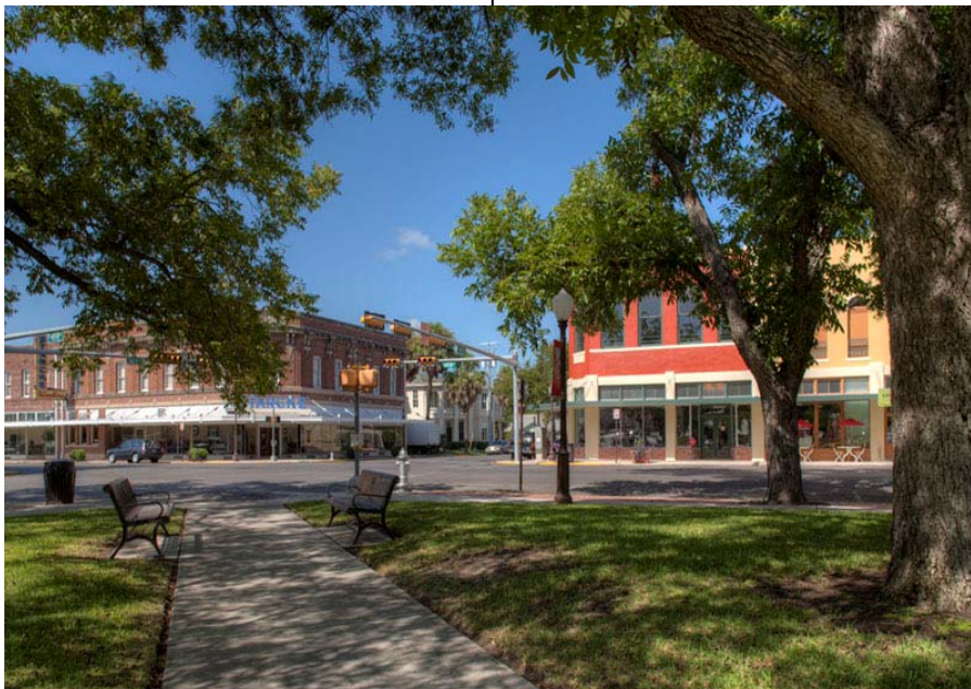
Downtown Seguin has been in the Main Street Program for more than 17 years and has spent millions on revitalizing its infrastructure.

Restructuring), partner with other groups to get more bang for the buck (Organization).