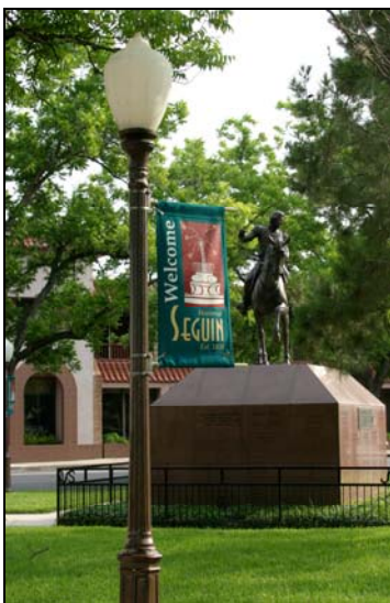
In the heart of downtown, this bronze sculpture pays tribute to the Tejano patriot Juan N. Seguin.

Upcoming projects scheduled to get underway soon include the restoration of a historic four-story hotel and the construction of a $14 million new library on the edge of downtown. Over the years, Main Street programs—and their managers—mature. But no matter