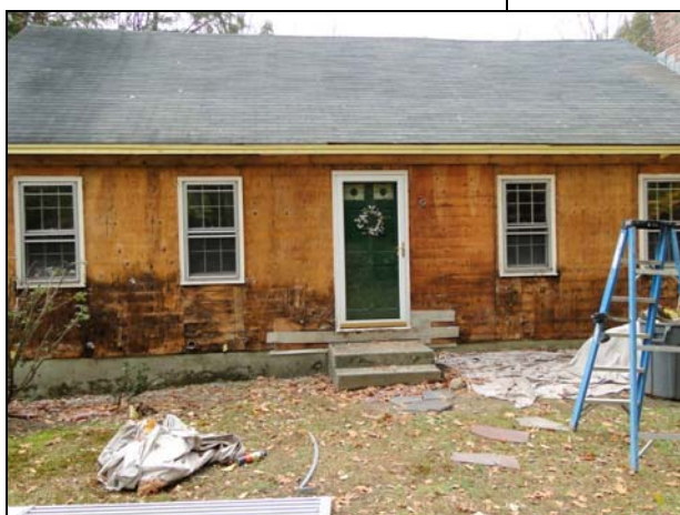
A lack of air movement and a vapor barrier on this home has damaged the wood sheathing.

Wall insulation in a wood structure. This has a high cost for installation and low return since energy loss out the walls is a relatively small percentage of the total, most of which can be attributed to air infiltration that can