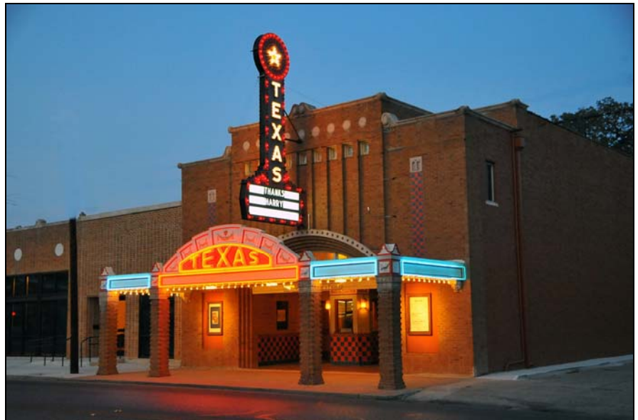
2011 saw the completion of the Texas Theatre, a $2.3 million restoration in downtown.

Other well-meaning citizens were equally kind, telling about all the previous failed attempts at revitalizing downtown. At one meeting the new manager was introduced as a "Yankee" which prompted the manager to ask: "Can