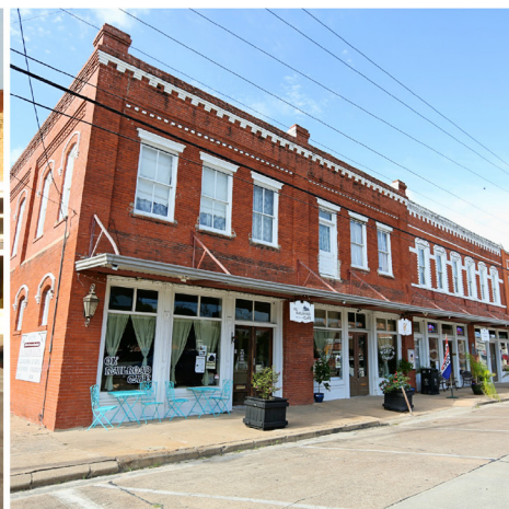
Downtown Ennis (left) and Rosenberg (right) have officially been named as 2015 Texas Main Street Cities.