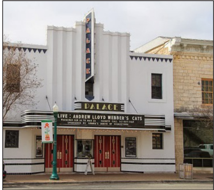
The Palace Theater in Georgetown is an excellent example of a restored theater in the heart of Main Street. Restored in 2000, the project took 3.5 years and a million dollar budget.

The economic benefits of restoring historic theaters to operating venues has been proven in case studies throughout the United States. Studies in other