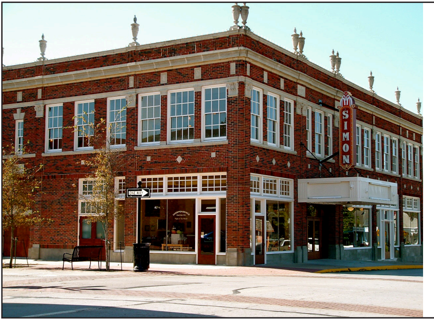
Simon Theater, Brenham.

in the back of the theatre, totally changing the look of the theatre.