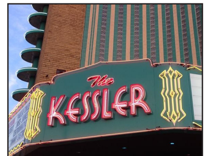
Example Channel Letter Sign – The Kessler Theater, Dallas, Texas