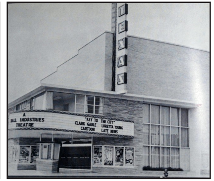
Texas Theater's interior and 1950 façade.