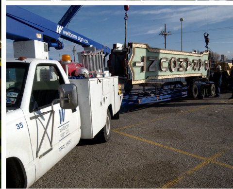
Restored Paramount sign (left), painting the sign (top right), and moving the sign (bottom right).