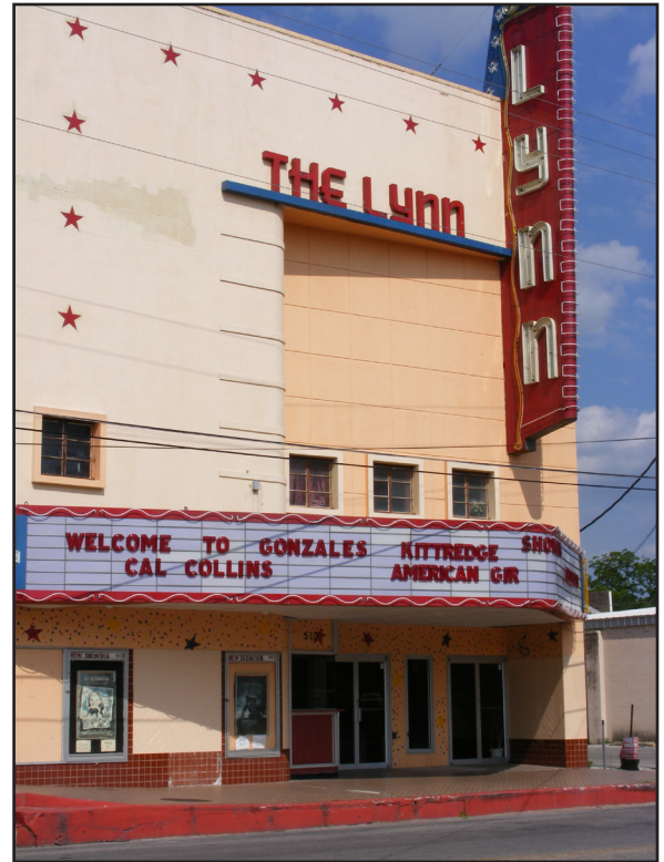
Lynn Theater, 2011

Little did the board know at the time, that it would lose its leader,