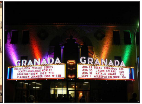
Granada Theater before (left) and after (right), Image Courtesy Plainview Main Street

A $250,000 restoration followed the purchase. Grants, fund-raisers, and donations helped to pay for stage curtains, lighting and sound systems, central heat and air, and other necessities. The restoration was made possible in large part thanks to free craftsman labor provided by prisoners from the local Wheeler Formby Unit.