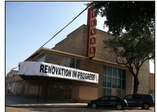
Kingsville's Texas Theater is currently under renovation. Before (left), During (center), and near completion (right)