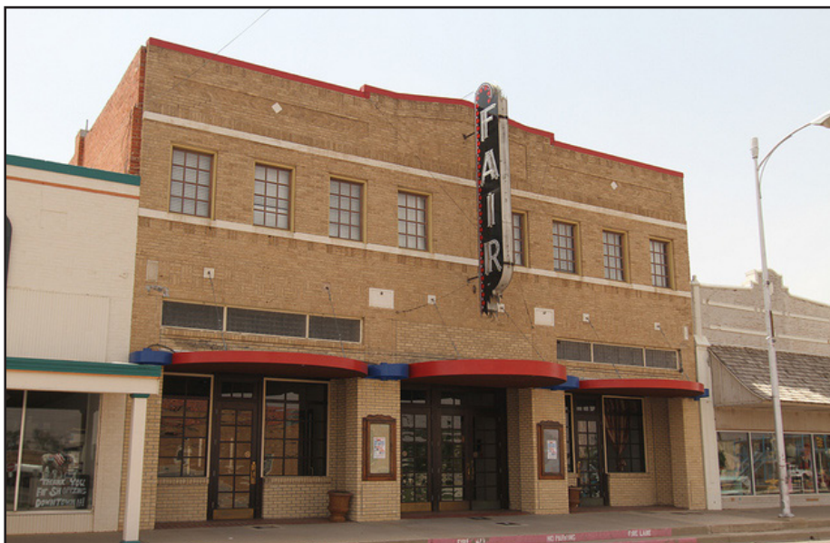
Fair Theater, 2011

In 2004, the building once again switched hands. The new owner purchased the dilapidated theater and worked hard to completely renovate the building, including installation of a new roof, plumbing, and electrical system. The balcony was closed off from the main space and a second screen was installed, so that two movies could be shown at the same time. The total investment was $400,000, which was financed through a combination of private funds and loans from the Gonzales Economic Development Corporation, the Gonzales County Revolving Loan, the Gonzales Area Development Corporation, and Prosperity Bank. At the time, the most costly expense was asbestos abatement, which ran $120,000