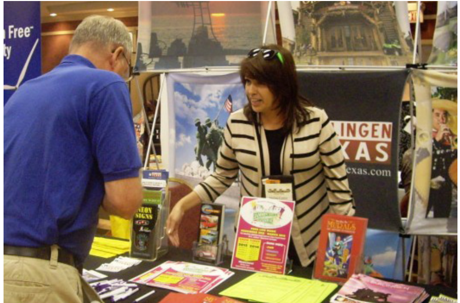
Coupons and other promotional items are distributed at the Winter Texan trade shows.

In the Rio Grande Valley, we are blessed with thousands of Winter Texans. The majority of them are retirees who migrate south seasonally from the upper Midwest and Canada. They mostly stay in RV and mobile home parks while in