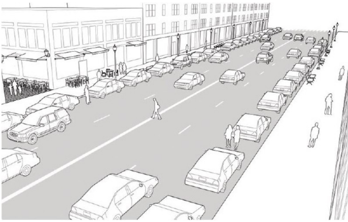
Figure 1. Image from the Urban Street Design Guide from the National Association of City Transportation Officials (NACTO)