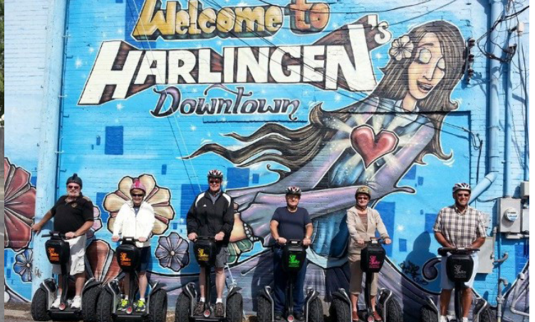
In downtown Harlingen, there are several popular activities available. (Top left) Red Hat Groups enjoy their time together at Inner Artist. Large crowds gather to take a downtown walking tour (top right), and (bottom left and right) Segway tours in downtown Harlingen.

might be 30 or 40 participants; other times there are 10-12, and occasionally just 1 or 2 people. And, at the end, guess what? Everyone gets discount coupons for restaurants in the district, many of which they strolled by on the tour.