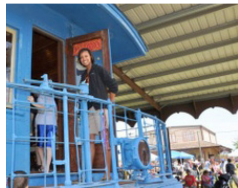
Guests tour the Rosenberg Railroad Museum.

Downtown Rosenberg also celebrates its railroad-oriented