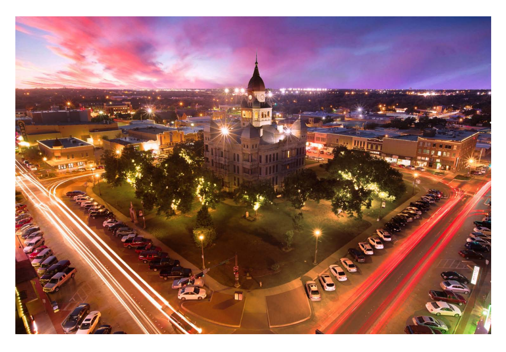
Nighttime view of Denton's Courthouse-on-the-Square. Denton's beautiful downtown is attracting attention after its $2.5 million courthouse restoration and new propety appearance guidelines that have gone into effect.

Campus Theatre. This project turned an abandoned movie house into a vibrant live performance venue, which is booked more than 300 nights a year. Most of the $1.2 million used to restore the building was raised from local resources. Since the restoration, restaurants, bars, live music venues, and a variety of new retail stores have sprung up in the vicinity of the theatre, proving that historic preservation equals economic development.