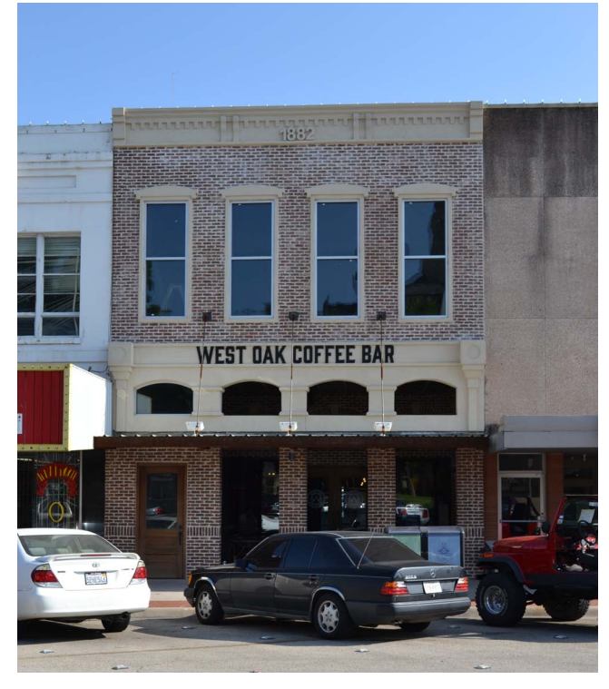
Downtown residency has slowly increased over the past 15 years. Residents are living downtown within a four-block radius of the of the Courthouse-on-the-Square in lofts, apartments, and townhomes. (Left image) Before and (Right image) after of 114 W Oak Street.