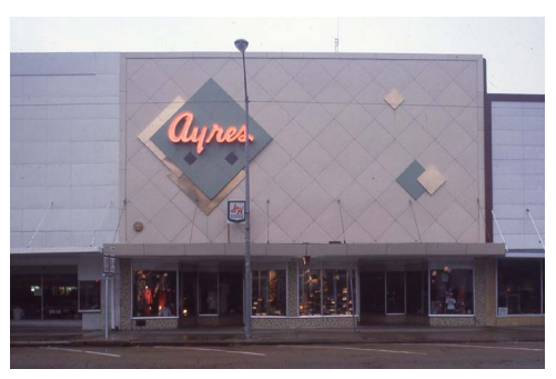
(Top image) Original facade; (Bottom image) Mid-century facade.