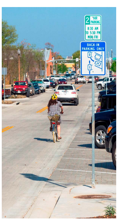
(Top image) Over the years, these projects have significantly increased the property values of the buildings. (Bottom left image) Denton Day of the Dead event; (Bottom middle image) Local Denton residents enjoy downtown events hosted by the DMSP; (Bottom right image) Public improvements have taken place in downtown Denton.