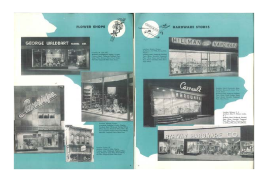
Storefront catalog

"The companies that produced glass and aluminum storefronts also promoted renovation. Glossy brochures showing sophisticated