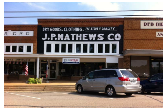
(Top) A major renovation project in San Augustine was J.P. Mathews Building and Mathews Medical Building. The owners wanted to remove the giant slipcover, and split the large building into two buildings. The Texas Main Street design staff helped the owners research and investigate what the buildings once looked like (middle left), and how to restore them back to their former glory (middle right). (Bottom left and right) Ghost signs were revealed and touched up, and new transom windows were replaced.

article takes the opportunity to highlight communities around the state and nation that have put the sun's rays to good use.