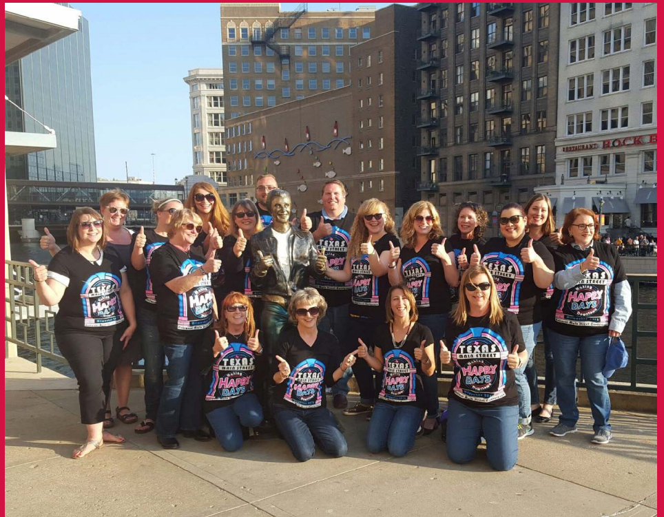
A handful of TMSP Staff and Main Street Managers all across Texas, recently traveled to Milwaukee, WI for the National Main Street Conference, Main Street NOW!