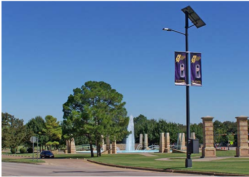
Solar-powered street lamp along Irving Boulevard.

the first three years of use. The project was funded by a U.S. Department of Energy, Energy Efficiency and Conservation Block Grant program.