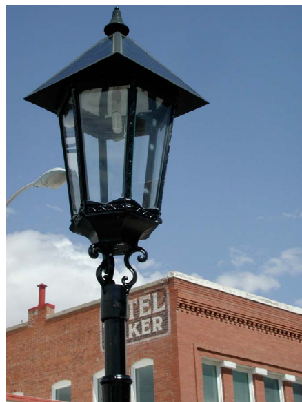
Example of solar-powered LED lights that replaced natural gas-powered lights in the city of Deming, New Mexico.

most downtown historic districts. However, solar technology is being applied to decorative lamp posts in other parts of the country. For example, Deming, New Mexico, a Main Street community ( http://demingmainstreet.org/ ), installed solar-powered LED fixtures on existing gas-fueled streetlight posts to produce their own electricity. The purpose of the installation was to replace the existing source of power without changing the unique design of the lamp post. The LED light re-creates the ambience of a gas light instead of the typical intense illumination that is often associated with LED light sources. This ambience was created by using a warmer yellow light bulb instead of the standard blue LED. Funding for the project was received through an Energy Efficiency and Conservation Block grant, funded by the American Recovery and Reinvestment Act.