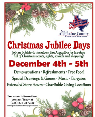
One of the secrets to San Augustine's success are their many events and promotions. From left are a promotional postcard for Junk in the Trunk, SFASU Theater Department at the Texas Treasure Heritage Festival, an event flyer for Christmas Jubilee Days.