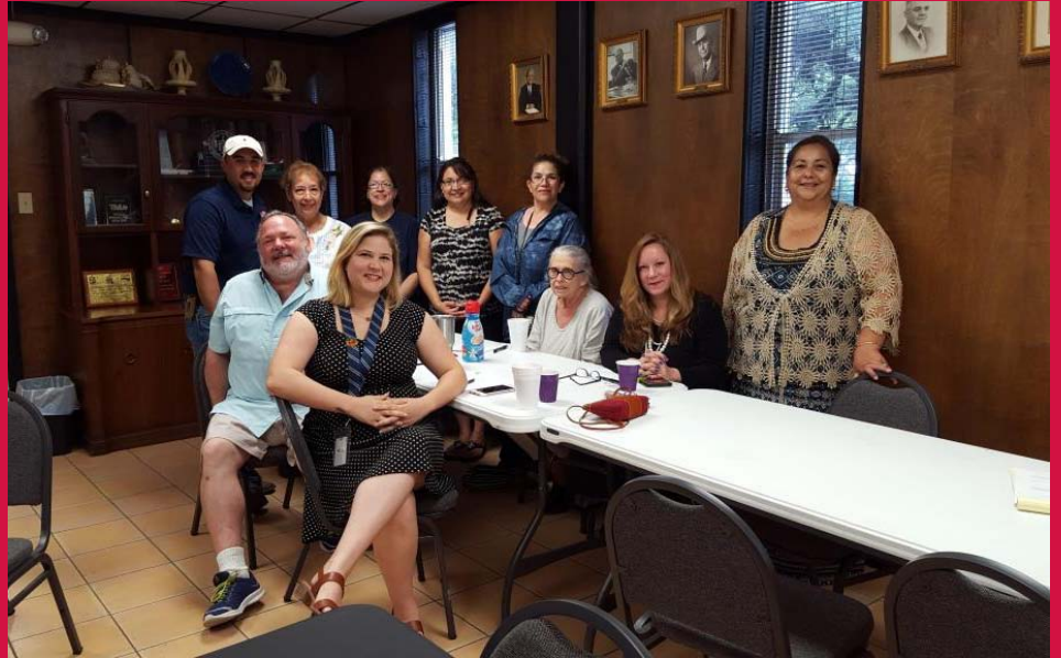
Board members, interested community members, and staff of the Goliad and Cuero Main Street programs recently met in Goliad council chambers for a Main Street 101 volunteer training.