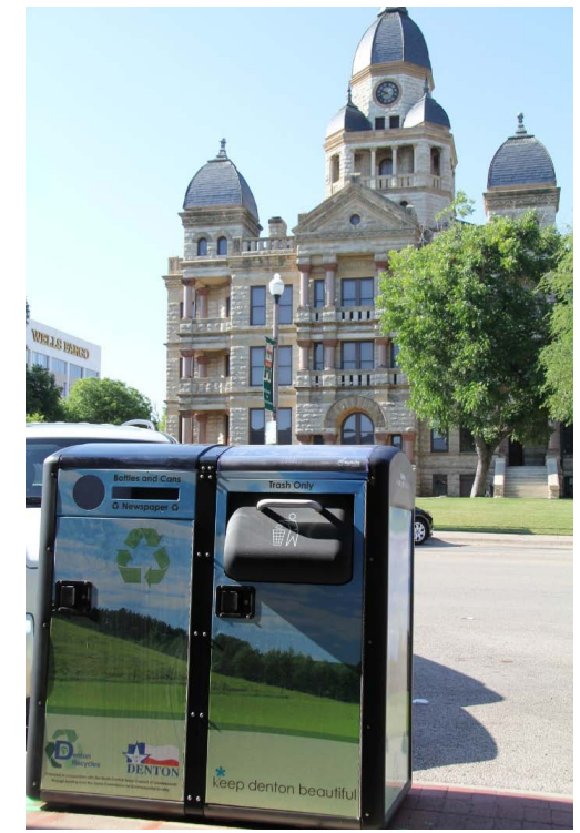
Big Belly trash and recycling containers in downtown Denton.

Similar style trash bins in New York serve double duty as a Wi-Fi hotspot. With the help of New York city-based Downtown Alliance, Big Belly has been conducting a pilot test in which several bins were turned into free public Wi-Fi hotspots, which