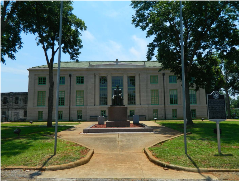
San Augustine's courthouse was restored in 2010. The original classical revival courthouse was built in 1927, constructed of limestone and concrete.

stores, restaurants, and professional offices in the pedestrian-friendly downtown district.