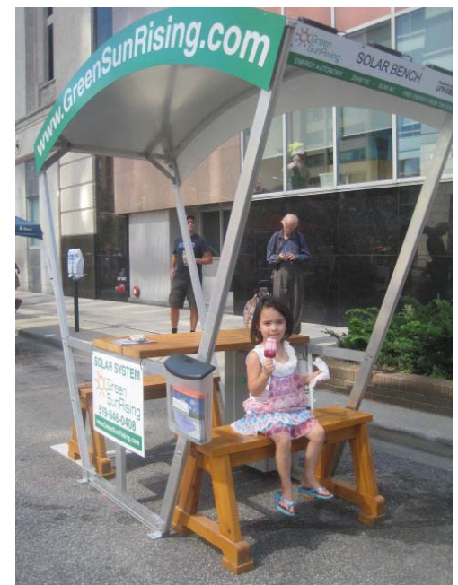
Solar bench that combines shade and charging station.