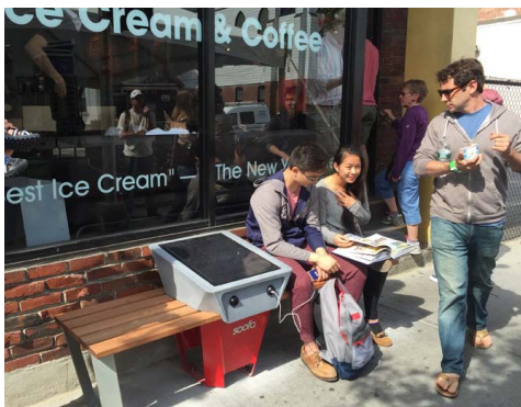
Smart bench in Cambridge Massachusetts.

Cambridge, Massachusetts upgraded several of its downtown benches with solar-powered charging stations. For now, the units benefit pedestrian traffic and add another amenity to the district. In a later phase, the “smart benches” will record different types of data levels of heat, light, and noise in public spaces. Pedestrian foot traffic data will also be collected for localized market research. For example, if a downtown district is trying to attract a grocery store or pharmacy to a neighborhood that doesn’t have one yet, the city will be able to easily access pedestrian foot traffic counts collected through the benches and use this information to grab a business’ interest.