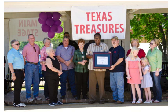
Three of San Augustine's longest running businesses: San Augustine Drug Company (left), San Augustine Motor Company (middle), and San Augustine Tribune (right) all received the Texas Treasure Business Award. A special award ceremony was held at the Texas Treasure Heritage Festival.

special award. Elected officials, THC staff, and San Augustine residents were just some of the many attendants at this event.