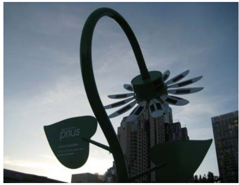
Wi-Fi Flowers in San Francisco’s Yerba Buena Gardens.