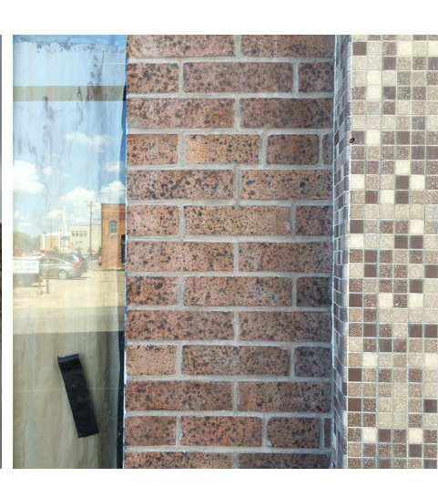
134 1st St. SW, (left) before paint removal; (middle) after paint removal; (right) brick after paint removal.