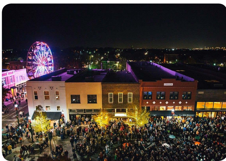
McKinney's downtown square has had many successes this year due a new downtown square infrastructure project and a new wayfinding system installed.