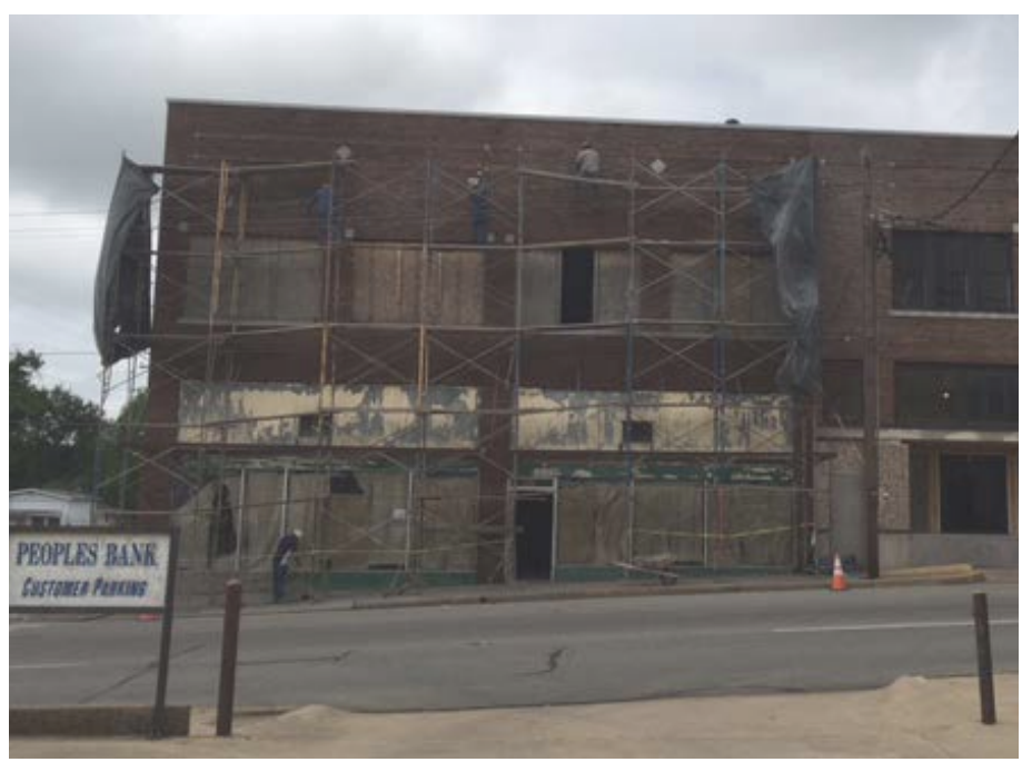
Paint removal in process at 134 1st St. SW in Paris.

(*Note - Each city has different regulations when it comes to chemicals and contaminates. Check your local regulations first to determine if this kind of product may be used in your downtown.)