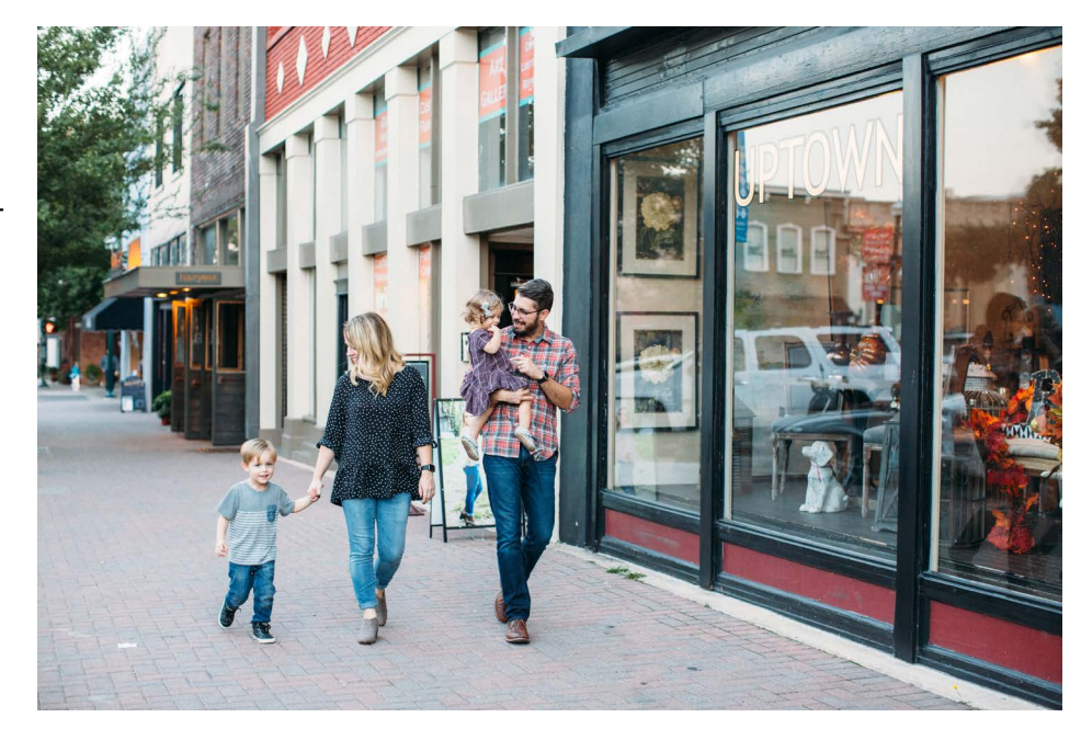
Redesign and reconstruction of the Downtown Square included tackling various design concepts. Some of these concepts included making the square more pedestrian-friendly, widening the sidewalks, encouraging uses of restaurants with outdoor seating, landscaping, and much more.

The Town Center Study Initiative is a sector planning study of the oldest part of McKinney, called for as part of the city's 2004 Comprehensive Plan. The Town Center is comprised of the historic core of the city and includes some of the oldest developments in McKinney. However, like many city centers, the challenge facing the town center has been learning how to create a renewed emphasis on the authentic form and character of the area while still encouraging reinvestment for the future.