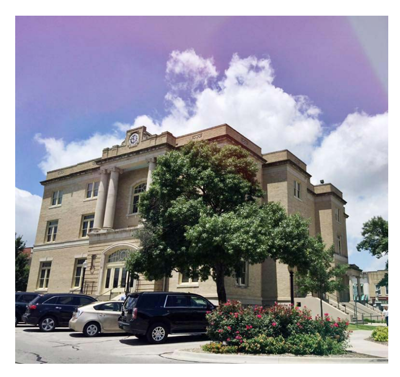
The courthouse square has been resurrected as a lively, relevant public space since the McKinney Performing Art Center's inception.

Community leaders and volunteers invested countless hours in research and planning for the restoration of this historic facility. The McKinney Community Development Corporation and City of McKinney moved forward and reviewed a compilation of community forums and planning sessions to evaluate the building's use and potential programming. In October 2003, a proposal was approved to re-craft the courthouse as a cultural center for the citizens of McKinney and Collin County.