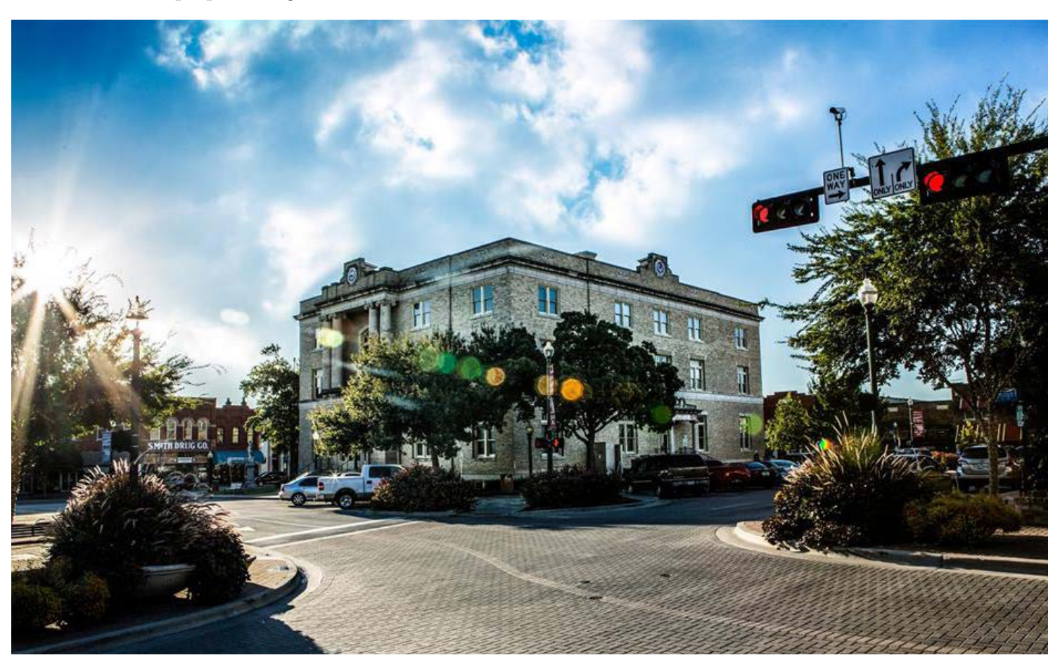
The McKinney Performing Arts Center at the historic Collin County Courthouse serves as a truly unique and professional multi-purpose venue where the community's cultural, artistic, and educational opportunities are nurtured.