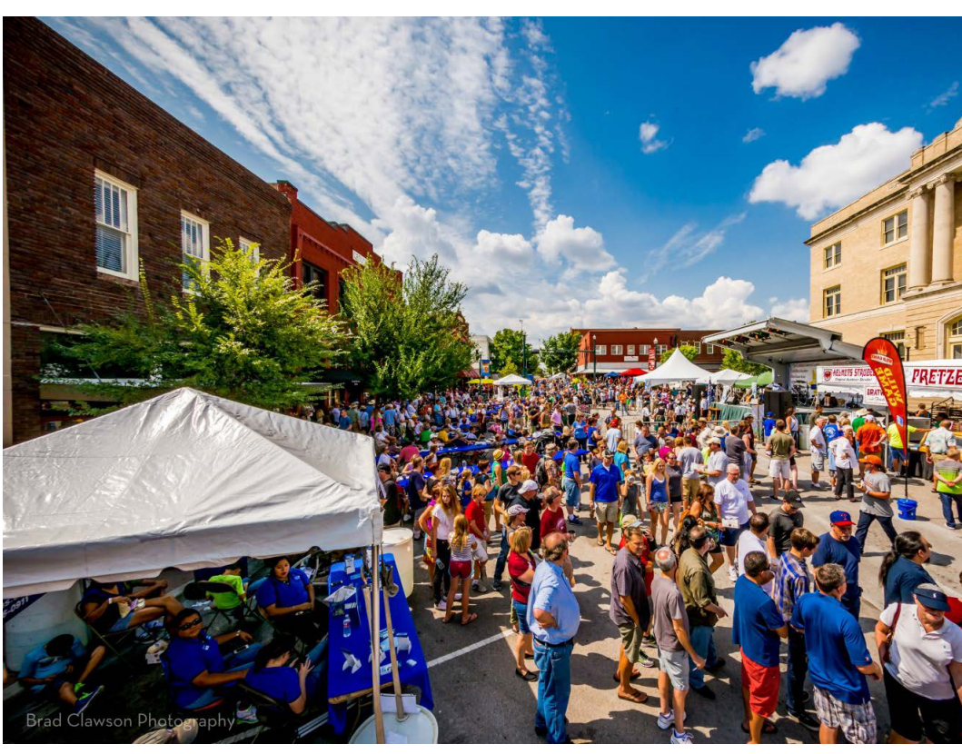
McKinney is wildly popular for its festivals and events, and Oktoberfest serves as one of McKinney's largest revenue sources.

The courthouse was drastically remodeled in 1927. Floor levels were changed, a basement and third floor were added, and the entire exterior was clad in buff brick. The