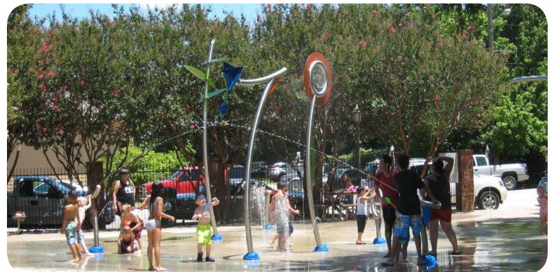
Waxahachie's downtown is booming with lots of changes lately, along with new businesses opening, residential units, restaurants, and a splash park.