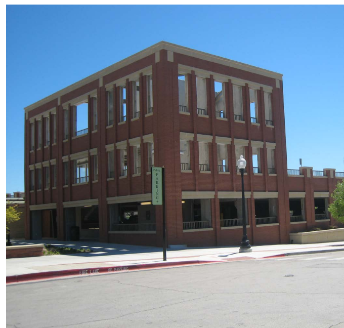
The Ellis County Courts & Administration building along with a three-story parking garage opened in 2010 for county employees.