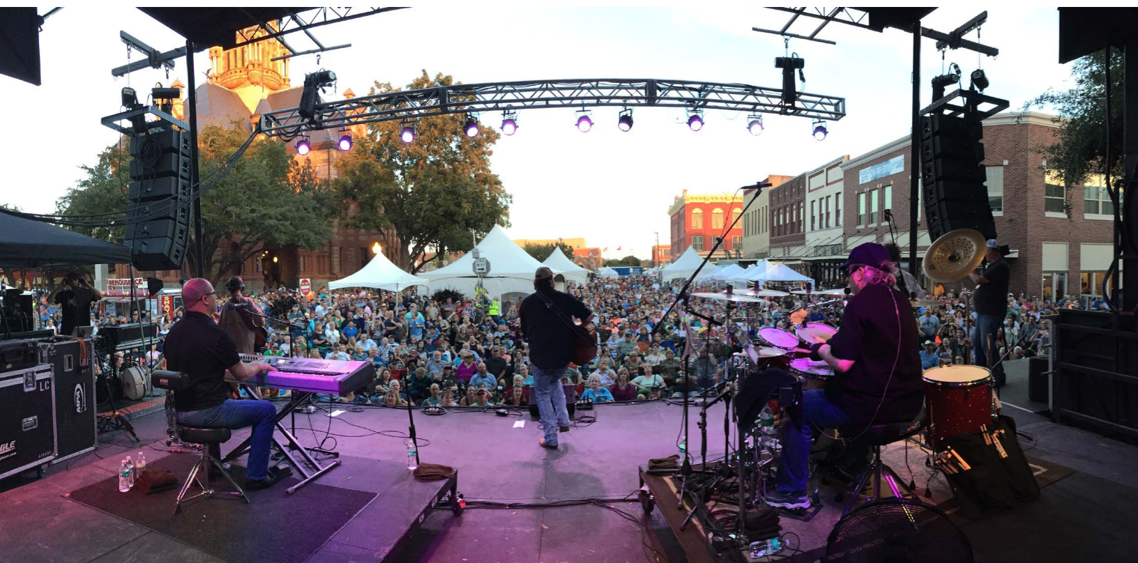
From parades, festivals, events, and concerts, there is plenty to choose from when visiting downtown Waxahachie.