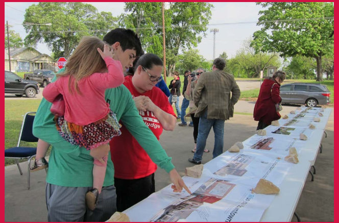
(Top left) The Corsicana Main Street board held a goal setting meeting during April. (Top right and bottom images) The Town Square Initiative and Canton Main Street kicked off the Downtown Action Plan process with an open house at the grand opening of the farmers market on April 21. About 150 people stopped by to see community survey results, add their stories to the memory boards, and vote on types of specific uses they would like to see downtown in the future.