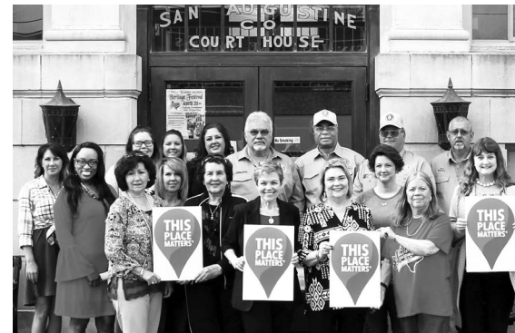
(Left and middle) Cuero held its first-time event, Hometown Harvest on Main Street. (Right) San Augustine supporters gathered at the San Augustine County Courthouse for a This Place Matters group picture.