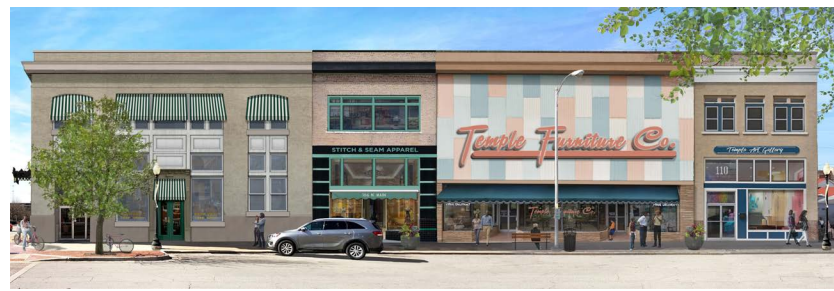
Part of the tradition of the Main Street First Lady's event is the unveiling of a rendering created by the TMSP design staff that is designed to demonstrate potential and possibilities for the historic downtown. (Top) The three buildings along Oak St. in the heart of the Pearsall Main Street district selected for the 2018 Pearsall First Lady's rendering include the 1916 Frio Masonic Lodge building that retains a high level of historic fabric. (Bottom) The set of buildings presented in the Temple First Lady's rendering along North Main Street target both a possible slipcover removal and restoration of historic features to several buildings, along with recommendation on another building to retain a mid-century slipcover.