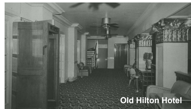
Old Hilton Hotel