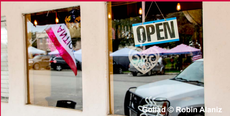
Goliad