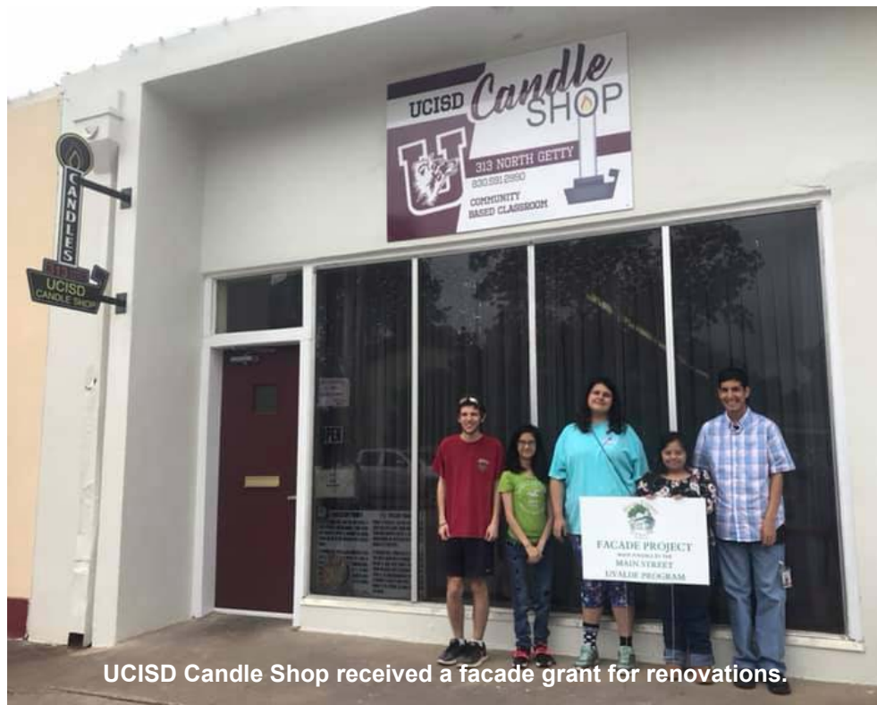
UCISD Candle Shop received a facade grant for renovations.

Mentoring young women for encouragement and empowerment, to become great leaders in their homes and work places.