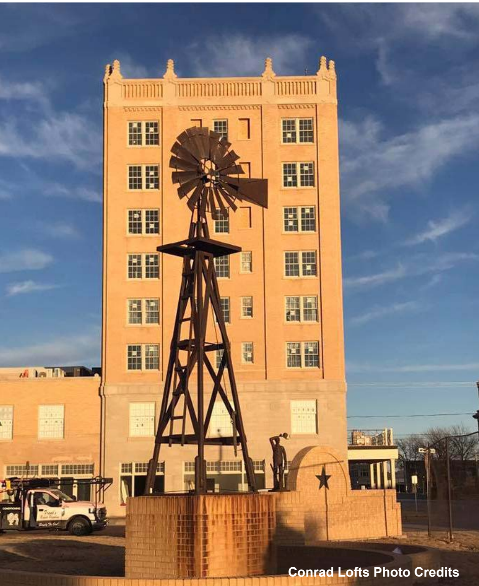
Conrad Lofts Photo Credits