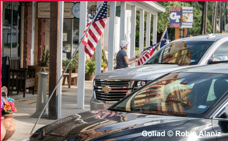
Goliad