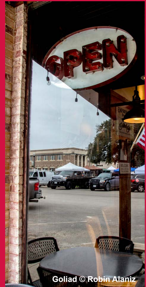
Goliad