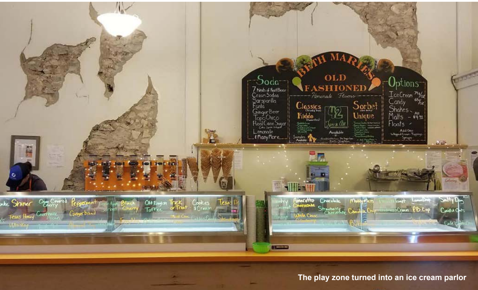
The play zone turned into an ice cream parlor

After studying downtown surveys to try to understand what Georgetown needed, the family rebuilt the play zone into an old-fashioned scooped ice cream parlor with 46 flavors all served on waffle cones baked fresh and all day in the store. They added floats, shakes, old-fashioned sodas, and over 500 kinds of candy to complete the 'Scoops' concept.