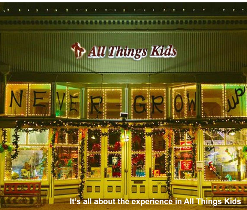
It's all about the experience in All Things Kids