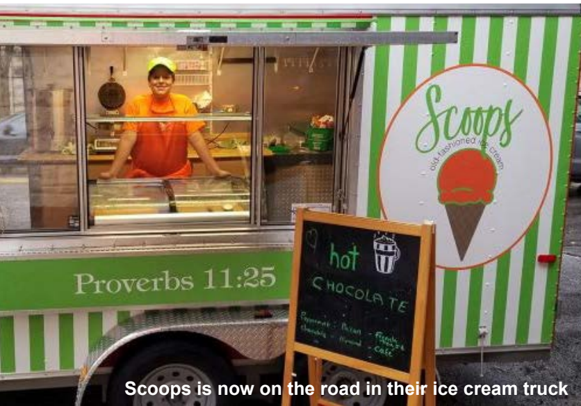
Scoops is now on the road in their ice cream truck