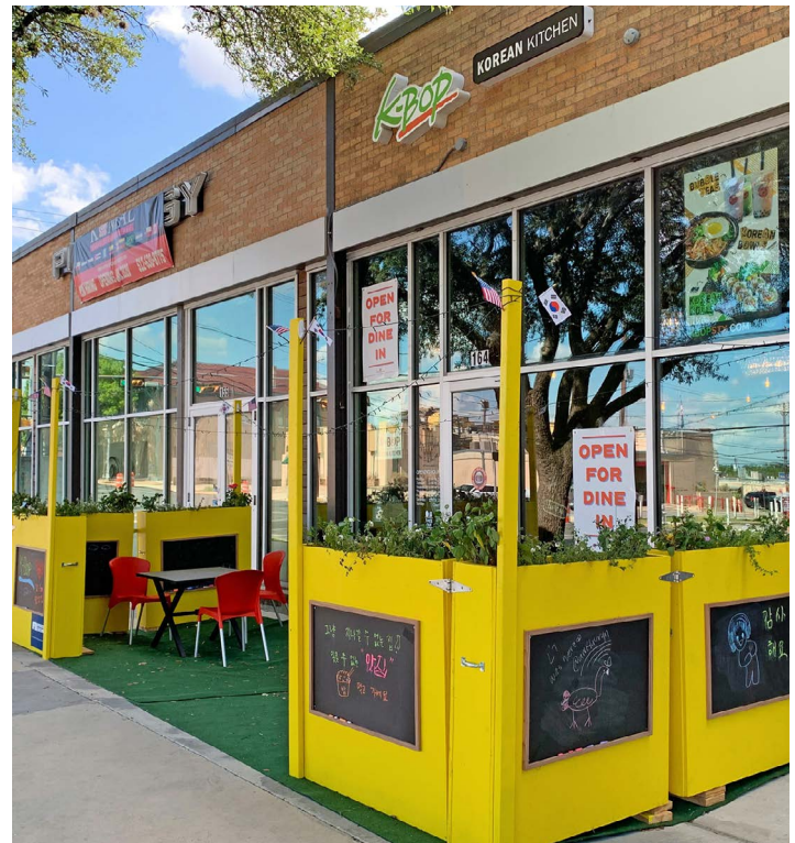
San Marcos business, K-Bop Korean Kitchen, captures some outdoor dining space by installing a temporary parklet.

One notable requirement of the New Braunfels grant program is that businesses that have an existing website cannot use the funds for redesign or site enhancements WITHOUT also including e-commerce enhancements. The grant’s stated program objectives reinforce the idea that E-commerce is crucial for the sustainability of downtown businesses: “The possibility of prolonged social distancing measures and the likely changes