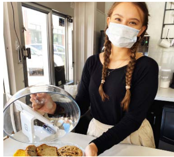
Main Street Ennis upped its Facebook game with frequent posts. Pictured here: Pop Top Coffee Shop.

Aware that businesses needed easy access to crucial information, many Main Street communities quickly