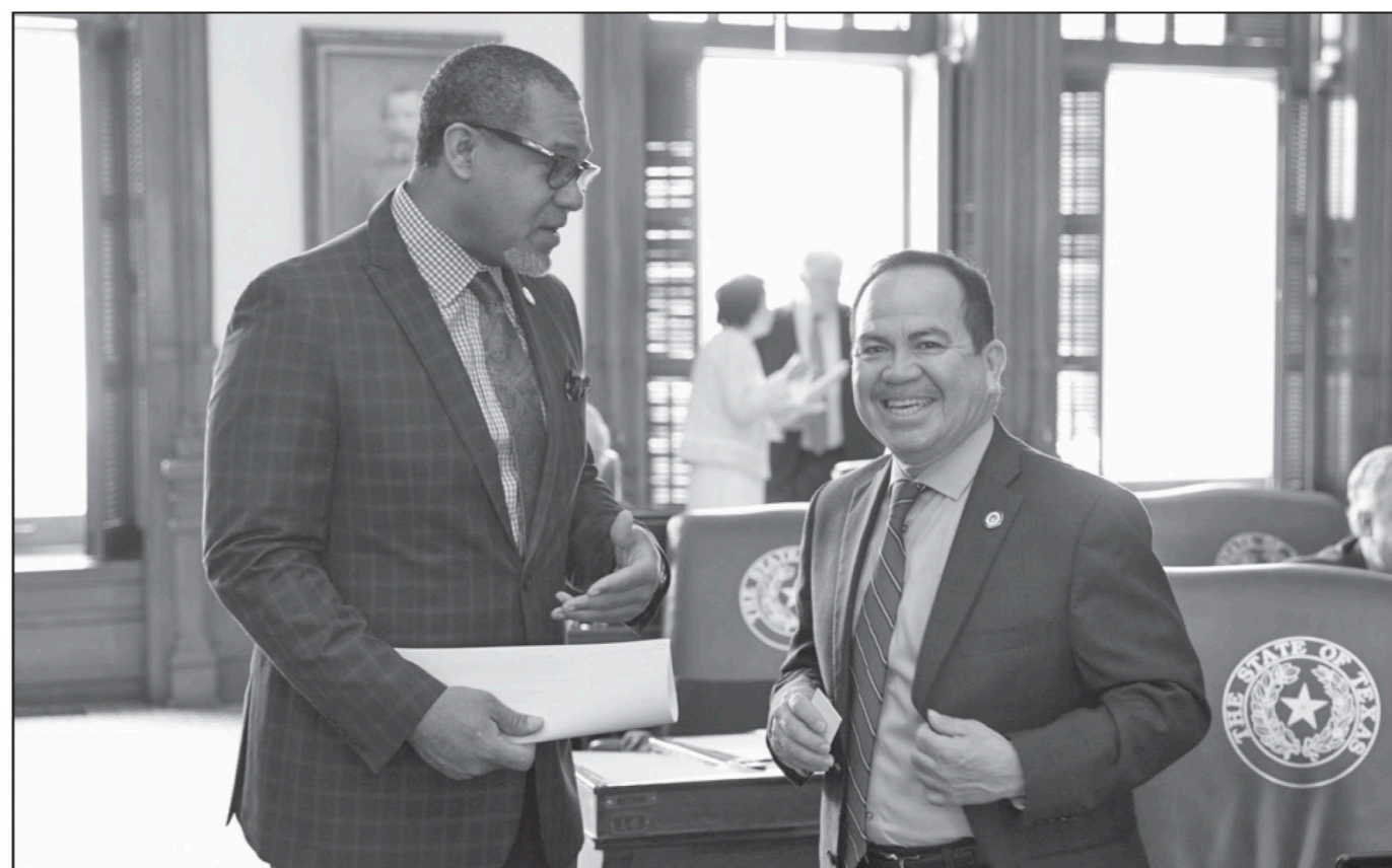
Representative Fierro meets with a colleague on the House Floor.

Individuals with Intellectual and Developmental Disabilities legally received below minimum wage pay, this legislation reverses the law allowing that practice, and ensures Texans all receive fair pay.