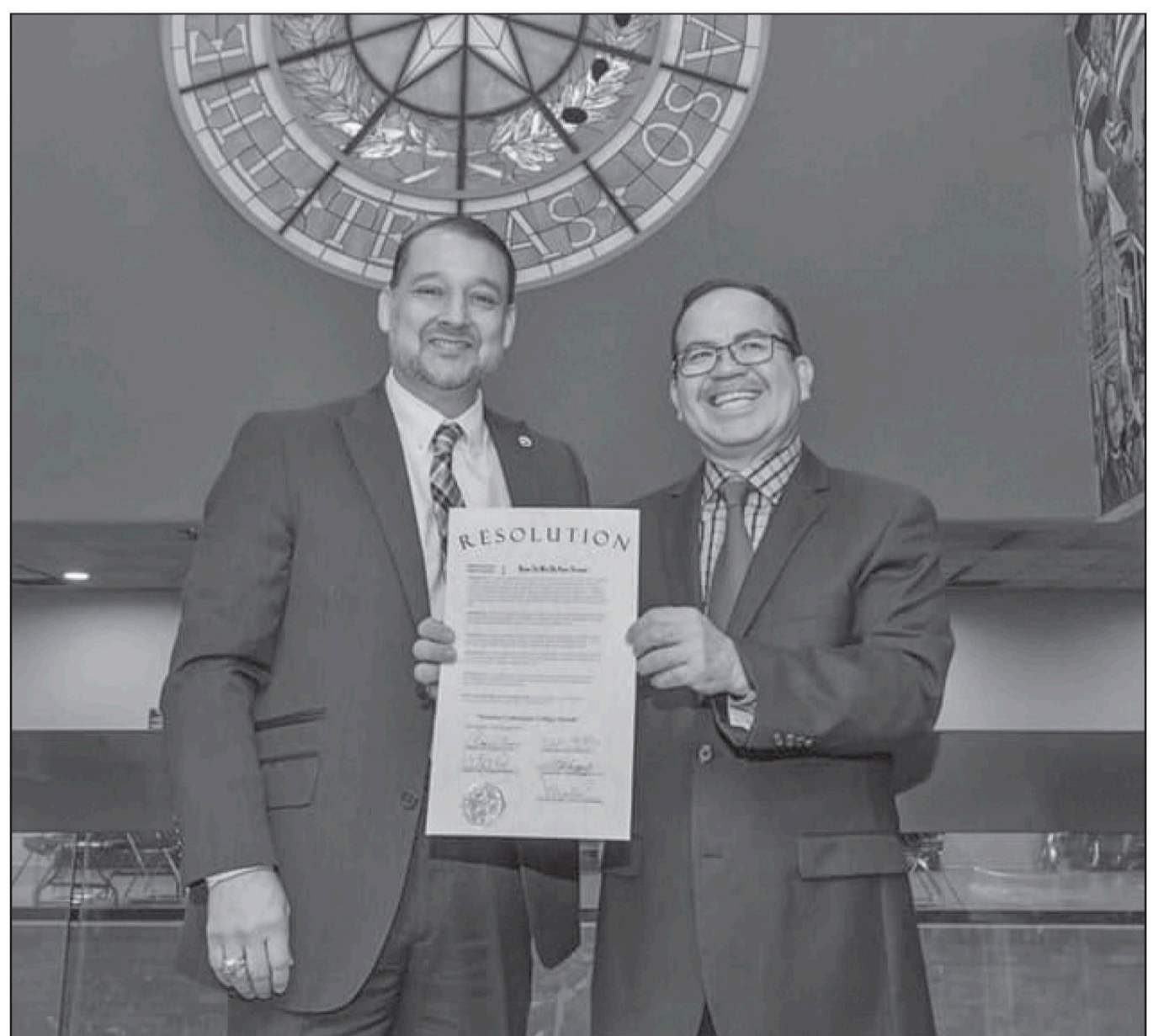
Representative Fierro presents Dr. Serrata with HR 1230, recognizing his many successes as President of El Paso Community College.

One of the highest costs associated with higher education is textbooks. The College Board estimates an average of over $1,200 spent on textbooks and materials. Commonly, this cost exceeds tuition costs, more often than not in community colleges. In the modern age, online resources are becoming more and more accessible, and plentiful. This law requires the Higher Education Coordinating Board to create a state repository for open educational resources. OERs range from textbooks to assessment software, full online courses to images and videos.