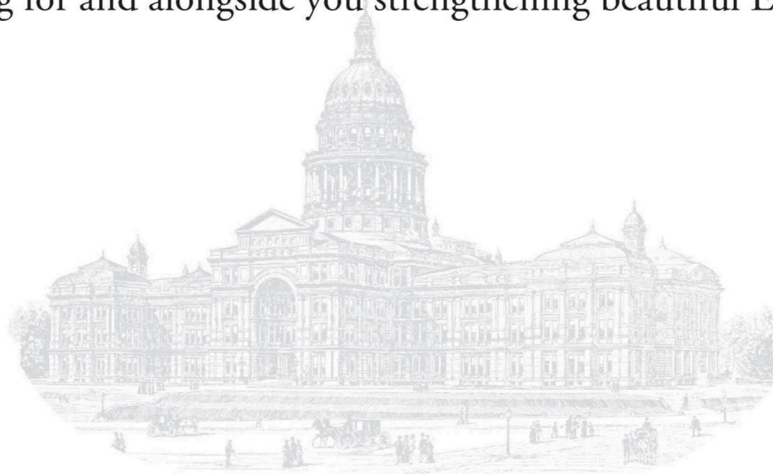
Art Fierro House District 79