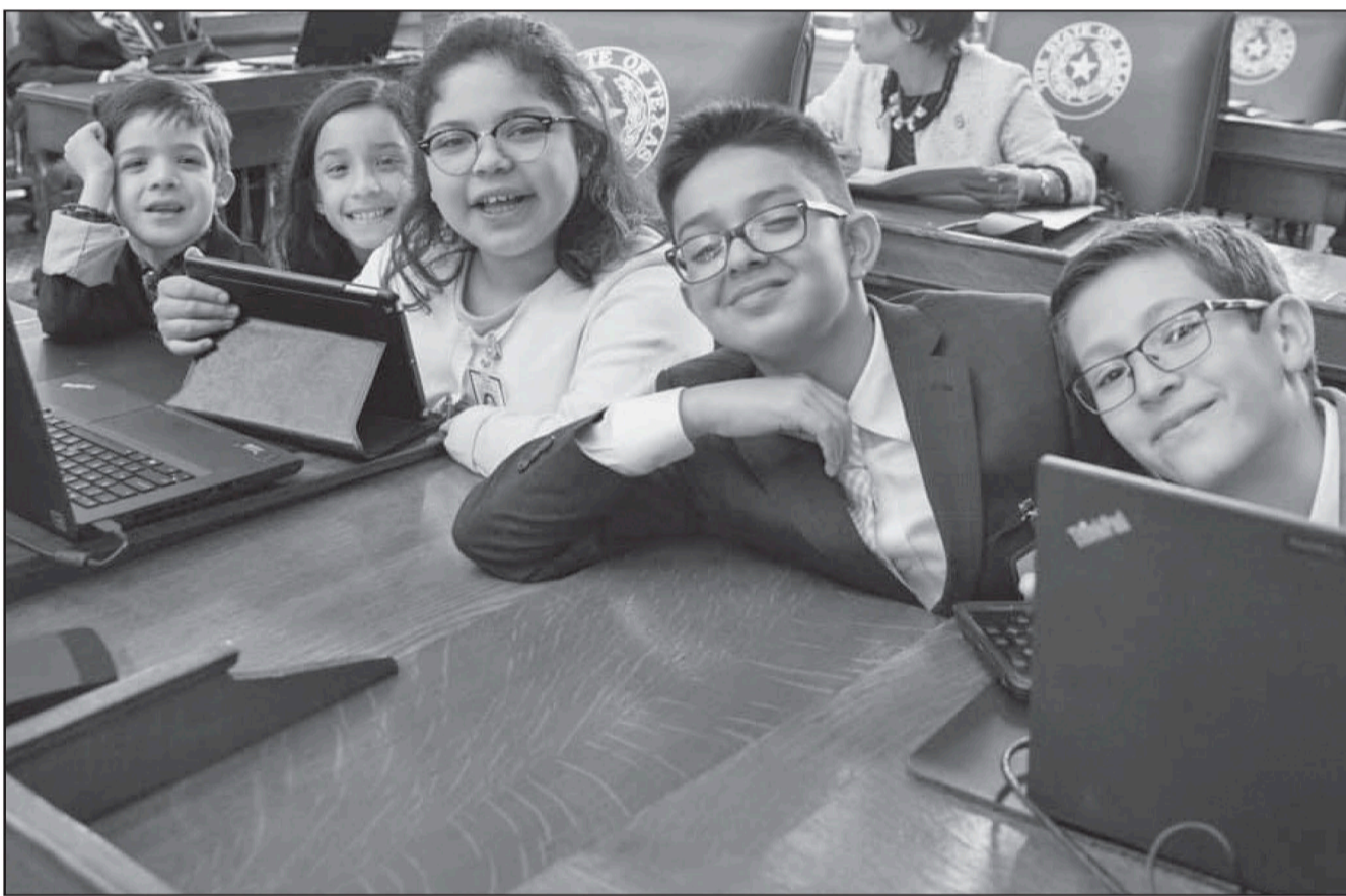
El Paso's next generation of leaders on the House Floor helping me pass bills.