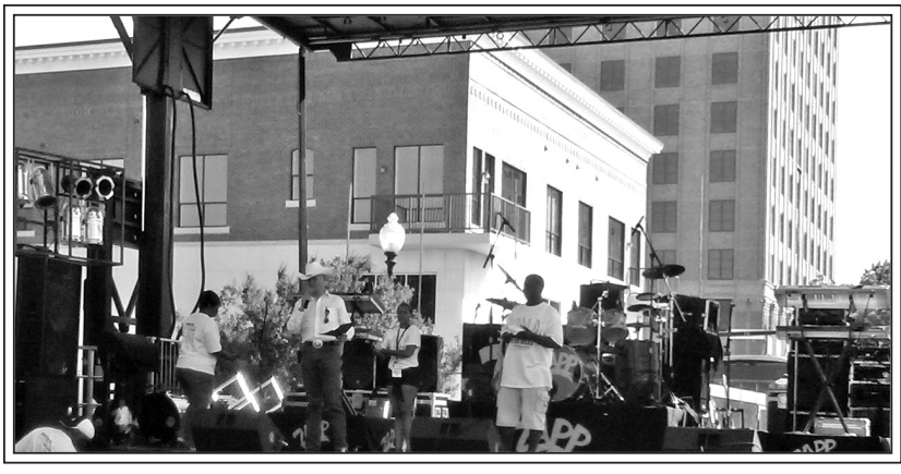
Doc read a State Resolution and Governor's Proclamation to the Juneteenth crowd at Heritage Square in downtown Waco. Radio station 104.9 "The Beat" sponsored the event in celebration of Juneteenth.