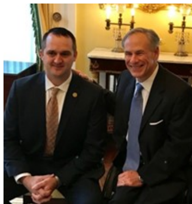
Meeting with Governor Abbott to discuss issues impacting HD18.