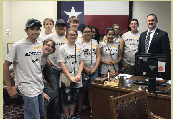
It is always enjoyable to welcome young people to their State House. These 8th graders from Devers ISD (Liberty Co.) were outstanding. A special thanks to their chaperones that saw value in making the trip to Austin.