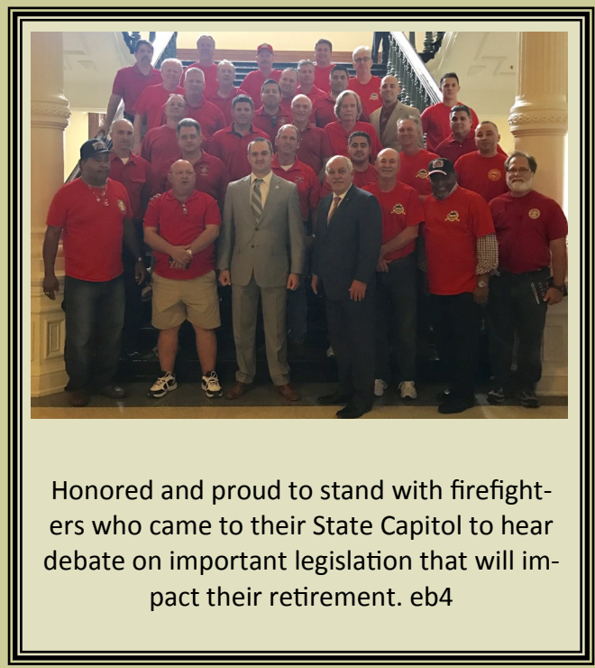
Honored and proud to stand with firefighters who came to their State Capitol to hear debate on important legislation that will impact their retirement. eb4