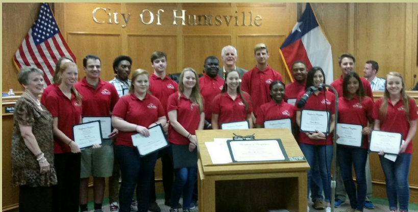
Congratulations to Huntsville ISD students on their graduation from the Huntsville Youth Leadership Institute. Huntsville Mayor Brauning joined representatives from the City of Huntsville to acknowledge the hard work of these future leaders. Good Job!!!