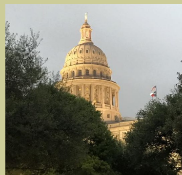
“As I walked to work this morning I thought about the business we would conduct, the significance of the flags flying, the people back home, and prayed for His blessings on this beautiful day. Thankful.” eb4