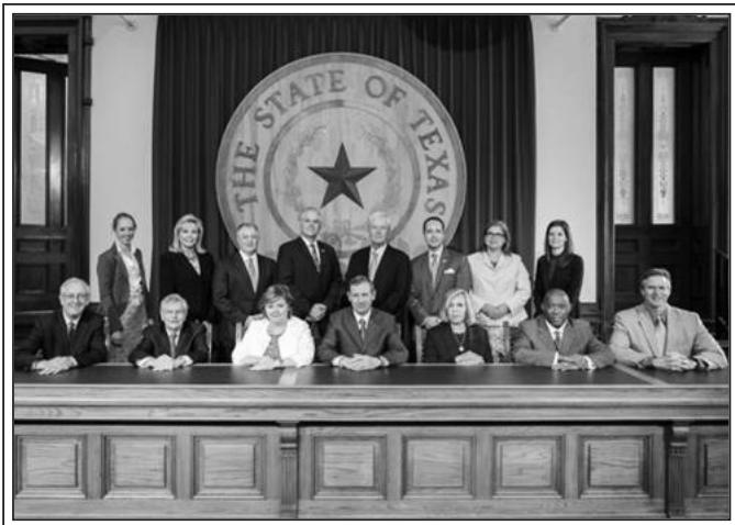
The House Committee on State Affairs