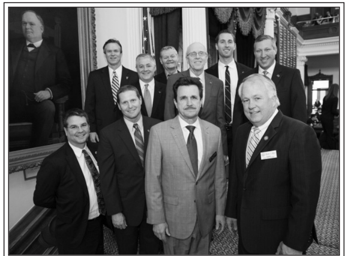
The Texas Tech delegation with legislators from West Texas.

Water, it is absolutely critical to our state! This session, we were able to come together and strengthen the framework to provide water for Texans for the foreseeable future. Texas has a State Water Plan for the next 50 years that was created by local communities in collaboration with the state. This plan must be funded, so the Legislature got to work and passed HB 4 and SJR 1 to set up a revolving loan program for local communities to fund their water projects. Voters will have the opportunity to vote on SJR 1, a constitutional amendment, on the November ballot. This will allow $2 billion to be used from the Economic Stabilization Fund to support the development of water projects across the state. The focus on water is occurring at a great time considering the extensive drought conditions we have been experiencing.