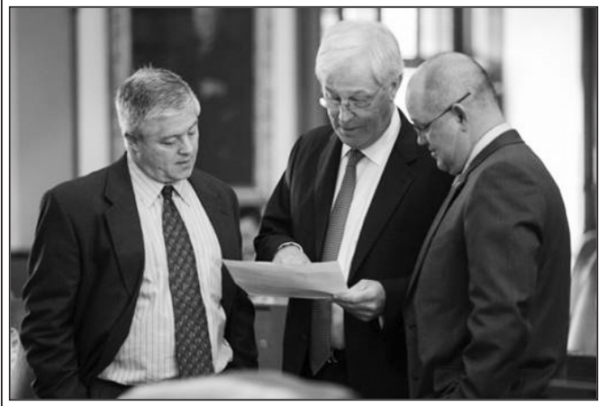
Rep. Frullo, Rep. Geren, and Rep. Kacal discuss legislation.