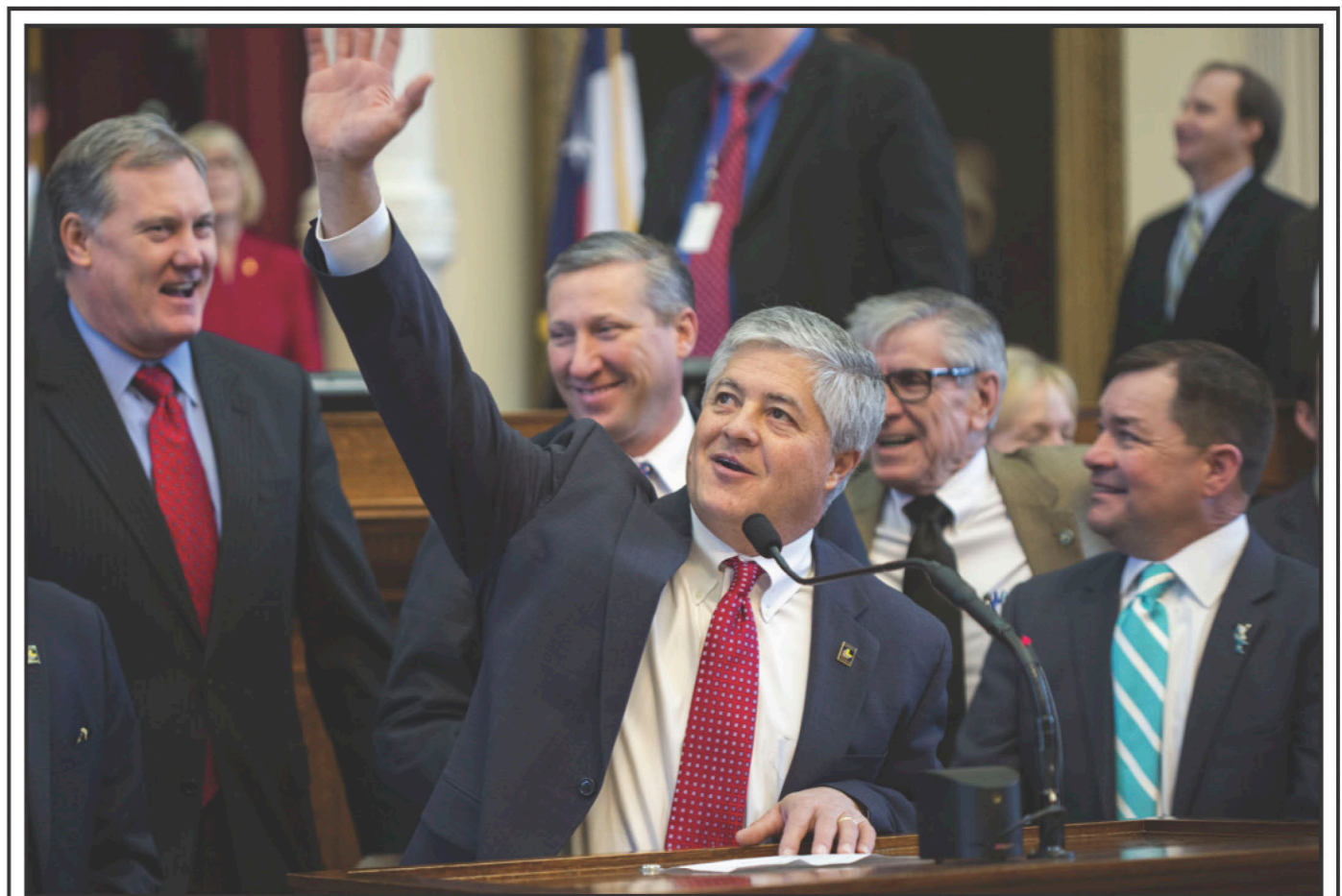
Rep. Frullo greets Lubbock visitors in the gallery, with Lubbock native Rep. Clardy, Rep. Springer, Rep. Stephenson, and Rep. King

The Texas House of Representatives is an Equal Opportunity Employer and does not discriminate on the basis of race, color, national origin, sex, religion, age or disability in employment or the provision of services. This newsletter is available in alternate formats upon request. Please call 1-800-241-1163