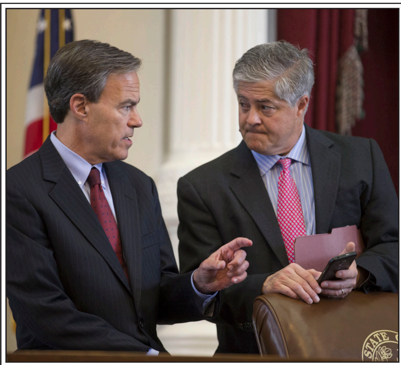
Speaker Straus and Rep. Frullo discussing legislation.

The Legislature fully funded the expected increase in enrollment of 80,000 students in our public schools. On top of that, the budget will provide an additional $1.5 billion in funding for public education. In response to Governor Abbott’s emergency item, we passed HB 4 which will provide up to $130 million in new funding for high quality prekindergarten programs. Lastly, we passed HB 2804 which will reform the school accountability system by creating a new “A-F” rating system so everyone can more clearly understand their school’s performance. Most importantly, this bill will decrease the emphasis on state-mandated standardized tests and will incorporate locally designed measures of student and community engagement. It will also allow for a quicker and more effective process to reform schools that continually fail to meet the academic standards.