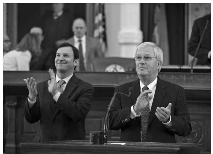
Rep. Geren & Rep. Goldman recognizing constituents in the Texas House gallery

The Texas House of Representatives is an Equal Opportunity Employer and does not discriminate on the basis of race, color, national origin, sex, religion, age or disability in employment or the provision of services. This newsletter is available in alternate formats upon request. Please call 1-800-241-1163.