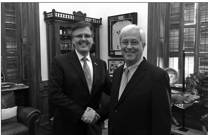
Lt. Governor Patrick & Rep. Geren in Lt. Governor’s Office