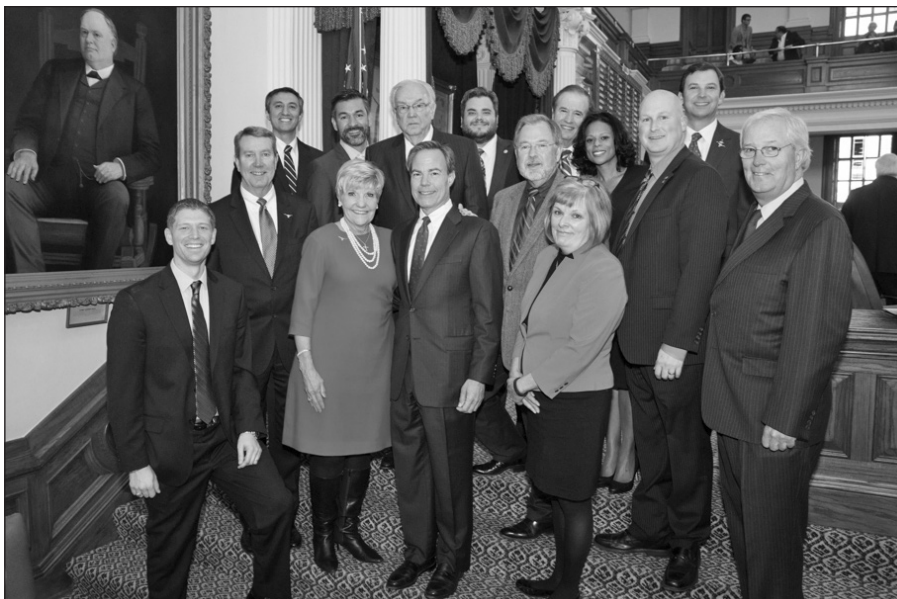
Rep. Geren, Fort Worth Mayor Price & Tarrant County Legislators & Guest