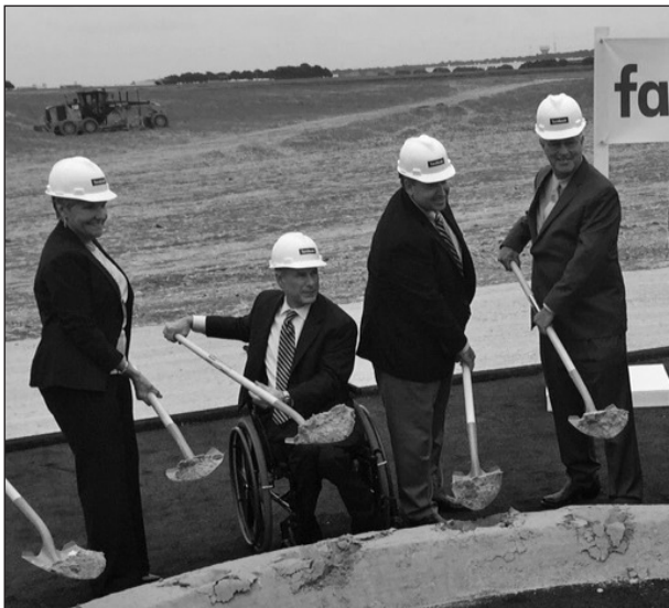
Governor Abbott, Fort Worth Mayor Price, & Rep. Geren at Facebook Groundbreaking