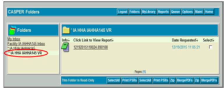
Example of agency agency's shared VR folder

The naming structure of the folder is as follows: [State Code] HHA [Facility ID] VR: Example: TX HHA XXXXX12 VR. System-generated OASIS Agency FVRs are available for 60 days in your agency's shared VR folder, after which time they are purged.