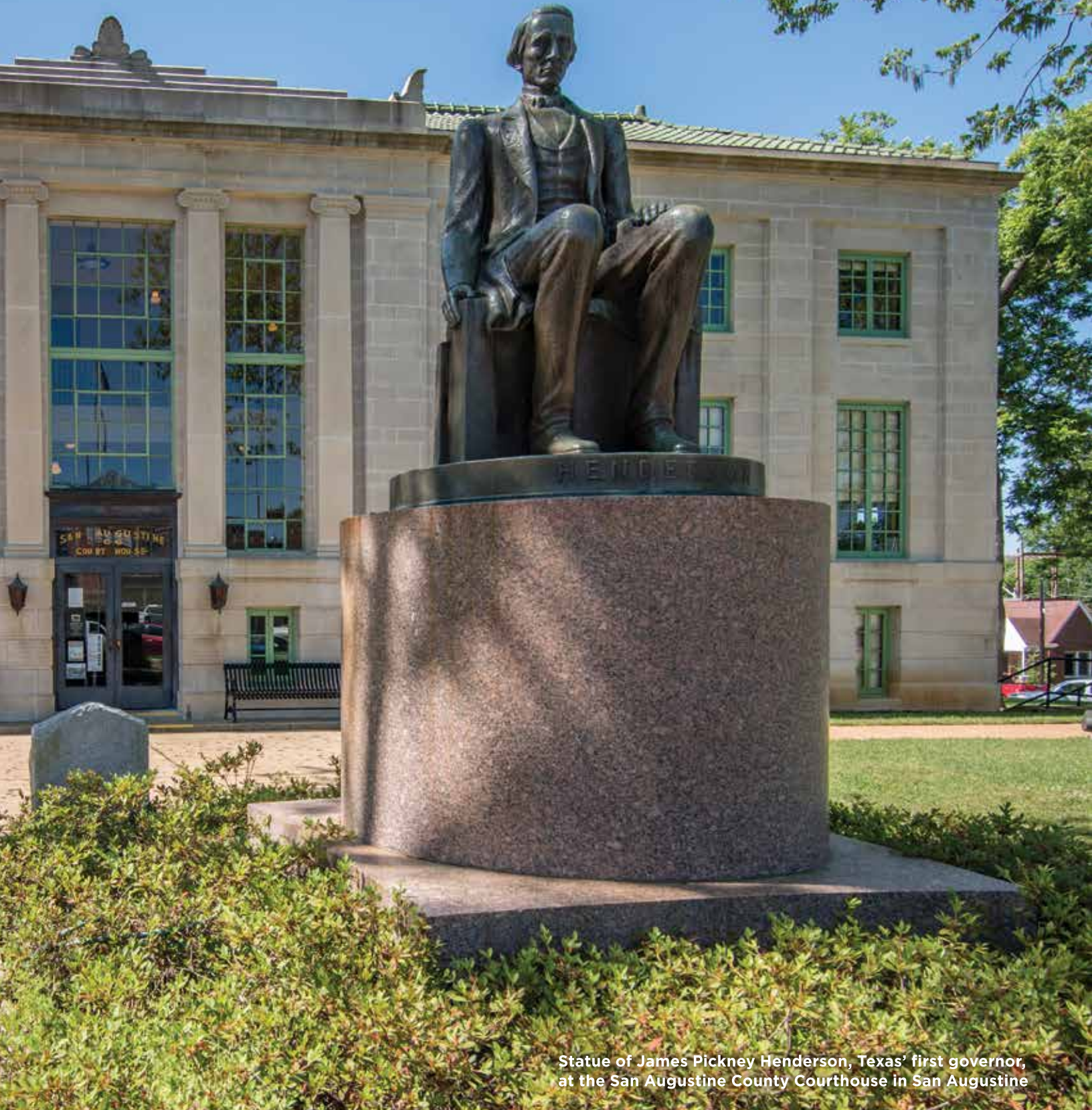
Statue of James Pickney Henderson, Texas' first governor, at the San Augustine County Courthouse in San Augustine