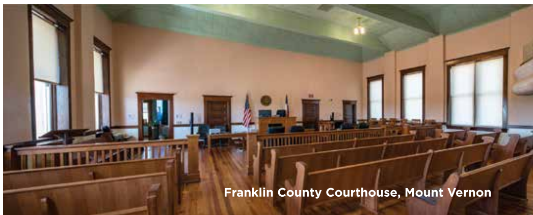
Franklin County Courthouse, Mount Vernon

This assistance has been bolstered by important statewide partnerships. The THC and the Texas Land Title Association, a statewide member-based trade organization for title agents, developed an annual workshop series for