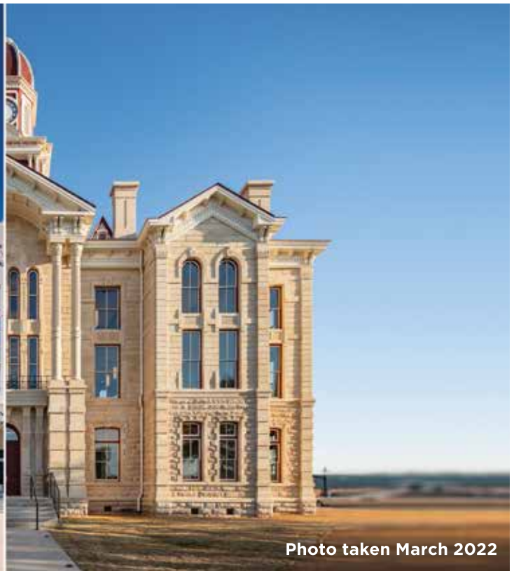
Photo taken March 2022

Praising the THCPP, Abbot stated, “We are not just trying to save an old building, although that is important. Courthouse preservation projects support the economy with more than 600 jobs yearly and more than 12,000 jobs total since this program began.”