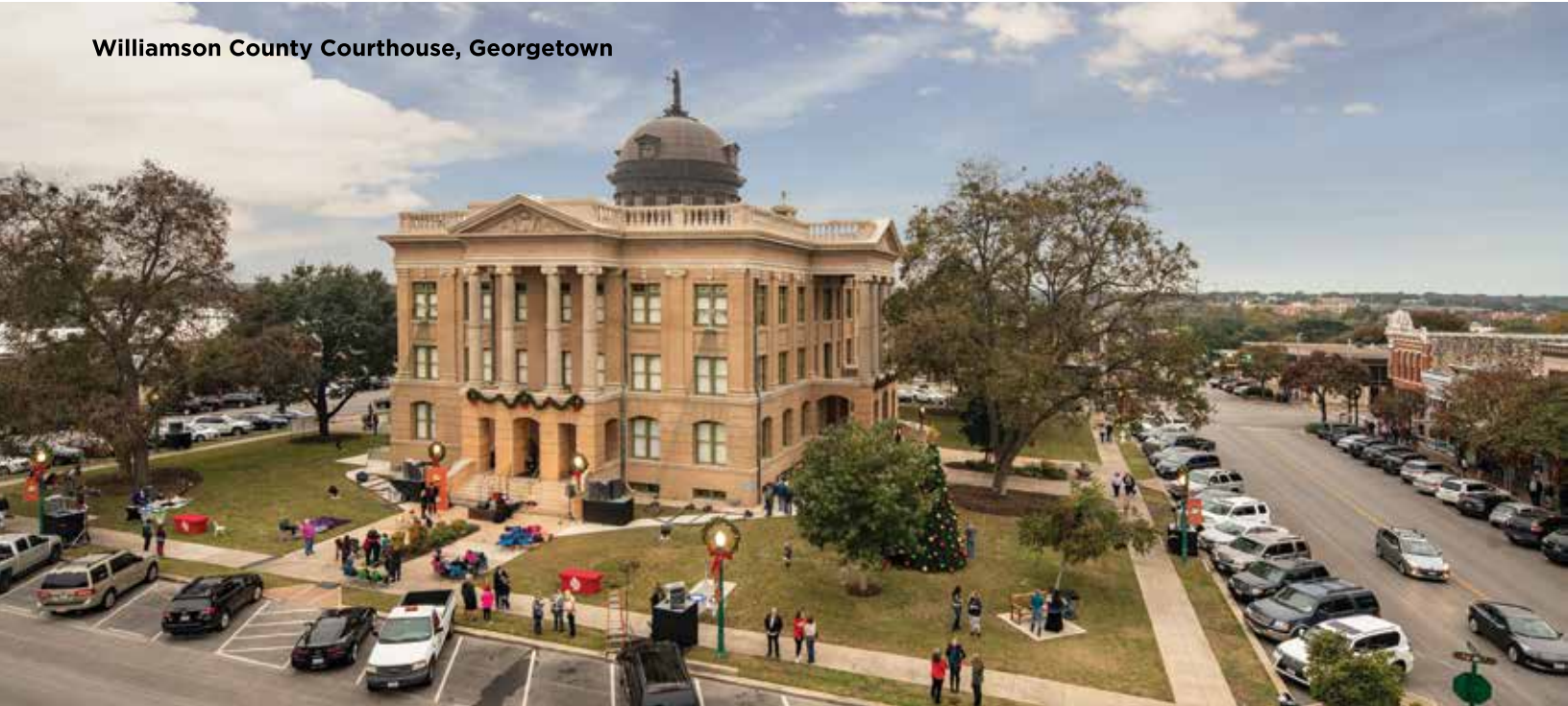
Williamson County Courthouse, Georgetown