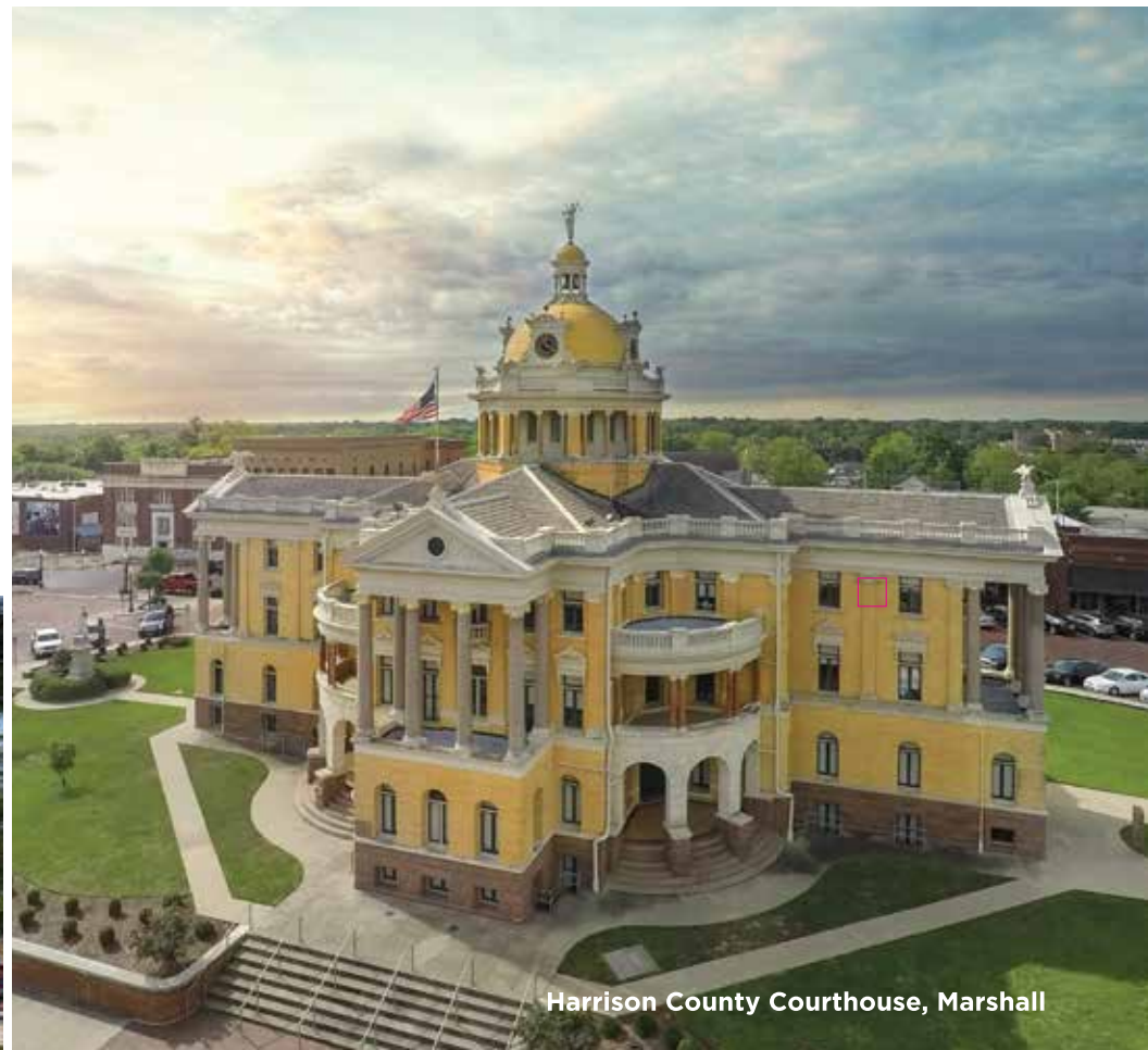
Harrison County Courthouse, Marshall

To learn more about the Texas Historic Courthouse Preservation Program, visit thc.texas.gov/thcpp .