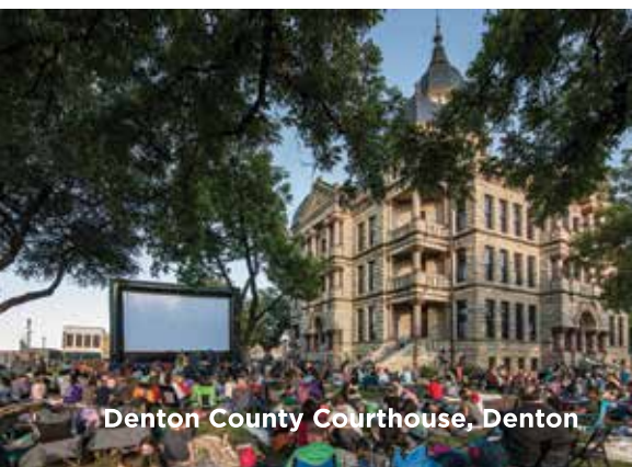
Denton County Courthouse, Denton

The East Texas town of San Augustine's restoration of its stately 1927 San Augustine County Courthouse sparked interest in downtown revitalization.