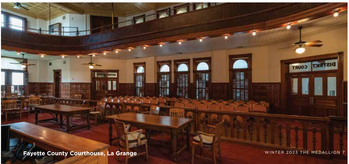
Fayette County Courthouse, La Grange

The economic impact has been especially significant in Texas' rural communities, where courthouses often anchor a historic downtown district, and the associated heritage travelers bring money to the community. Restored courthouses reinvigorate historic downtowns and promote tourism, which, according to the Office of the Governor—Economic Development and Tourism, is a nearly $77 billion annual industry, with visitor spending in the state directly supporting more than 625,000 jobs in 2021 and generating $7.9 billion in state and local taxes.