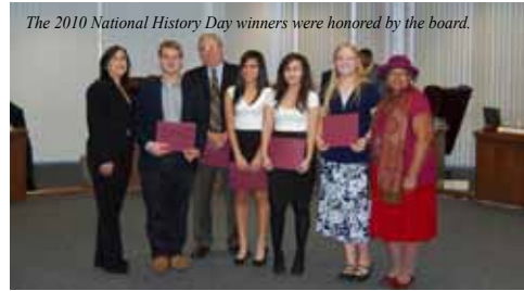
The 2010 National History Day winners were honored by the board.