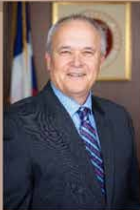
Windcrest Mayor, Dan Reese