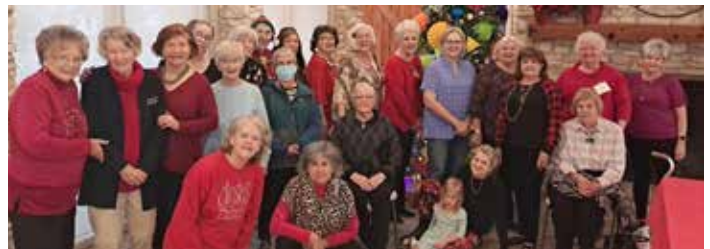
WGC members gather around the festive Civic Center Christmas tree.