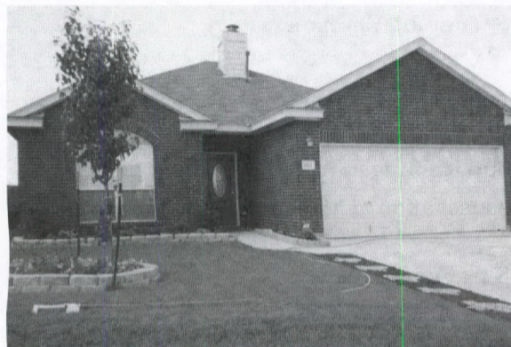
One of the homes built in Elgin with assistance from the HIF program of ORCA.

While the city initially targeted 51 percent of the units built under this program to benefit persons of low to moderate income, as required by program guidelines, at the completion of the project in August 2001, 55 percent of the units were reported to be occupied by low- and moderate-income families.