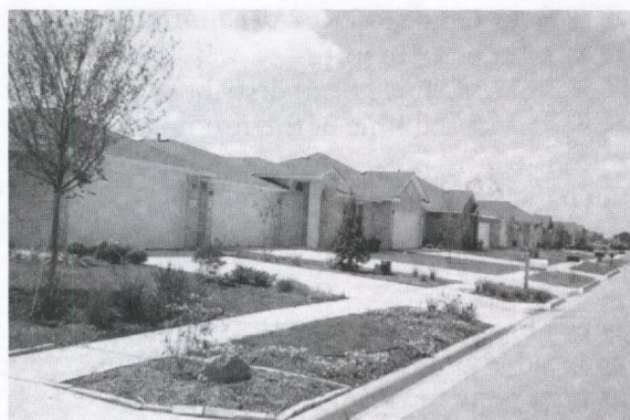
The HIF program provided funds to assist with building the infrastructure necessary to complete the first phase of the Shenandoah Subdivision in Elgin.

The HIF provides infrastructure grants in support of affordable single-family and multifamily low- to moderate-income housing. Funds may not be used for the actual construction costs of new housing, however