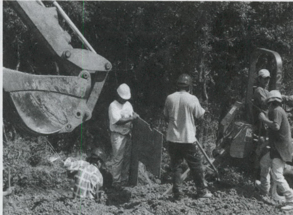
Kennedy Ridge volunteers work on installing their new water and sewer systems.