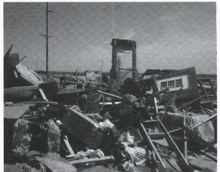
The remains of one of the homes destroyed by the tornado that struck Happy.

On May 9, 2002, representatives from ORCA's Disaster Relief program and the HOME disaster relief program of the Texas Department of Housing and Community Affairs (TDHCA) met with TXDPS-DEM, the mayor of Happy and the Swisher County Judge to identify the next steps necessary for rebuilding the damaged area of the city.