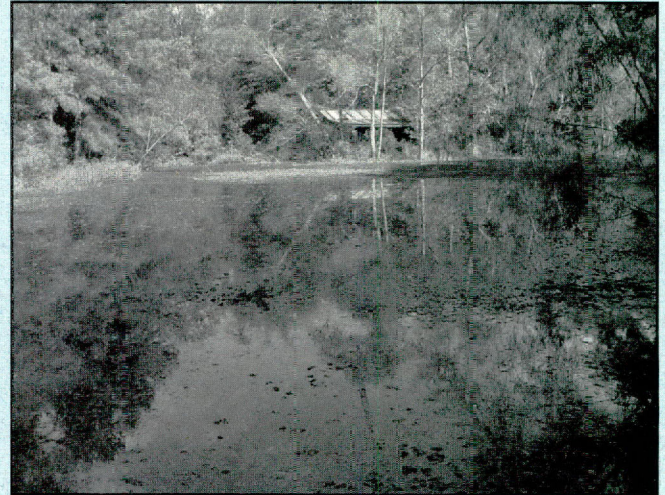
This picture of the same pond was taken on 9/7/01, or about 73 days after treatment with Sonar® A.S. Reports state that the pond is now 100% free of giant salvinia.

Diquat dibromide (Reward®) at .75% v/v or 3 quarts per acre has been employed since spraying began on Toledo Bend in May 1999. The adjuvants used in combination are: a non-ionic penetrant (either Aqua-King Plus® or Activate III®) at .25% v/v or 1 quart per acre and a non-ionic organo-silicone Thoroughbred at 12 ounces per acre. Initially, only 6 ounces of the organo-silicone were used, but field tests indicated a higher herbicide efficacy with the 12 ounces. Some applicators are now even using a full pint of the organo-silicone. The hairs or pubescence on the leaf surface of giant salvinia actually repels moisture so that the organo-silicone is a valuable and necessary component of the spray mix.