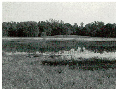
Before and after photos of a constructed wetland in Panola County.

the amount of land owned between the landowners exceeding 74,000 acres. Seventeen wetland proposals were developed between project biologists, Ducks Unlimited and Natural Resources Conservation Service personnel; 13 of which were approved for habitat improvement on 527 wetland-acres. There is very high interest in wetland development of private lands in East Texas, with over 25 additional sites, in excess of 1,500 acres, waiting for survey and wetland habitat design.