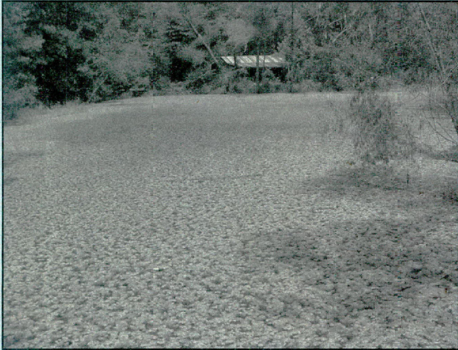
This 0.75-acre pond at Splendora, Texas, just north of Houston, was heavily infested with giant salvinia when this picture was taken on 6/28/01. The pond was treated with aquatic herbicide Sonar® A.S. on the same day.