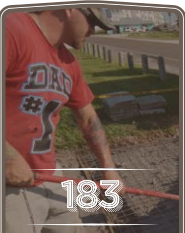
Major maintenance projects completed in fiscal years 2015-16

Volunteer hours contributed at the THC's historic sites in fiscal vears 2015-16