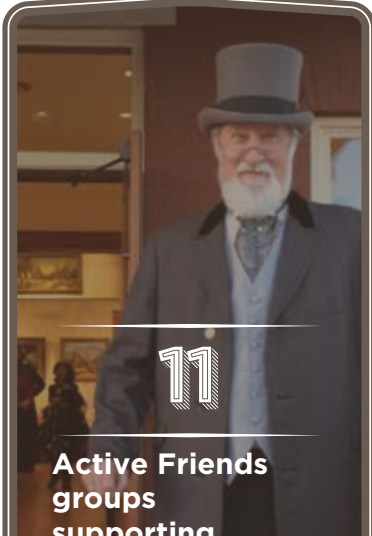
supporting historic sites