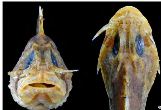
This soldierfish ( Gymnapistes marmoratus ) has one saber in and the other saber out on either side of its head.