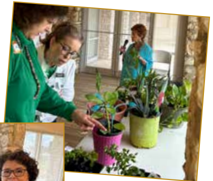
Ruby helping to display the collection of plants auctioned at the meeting.