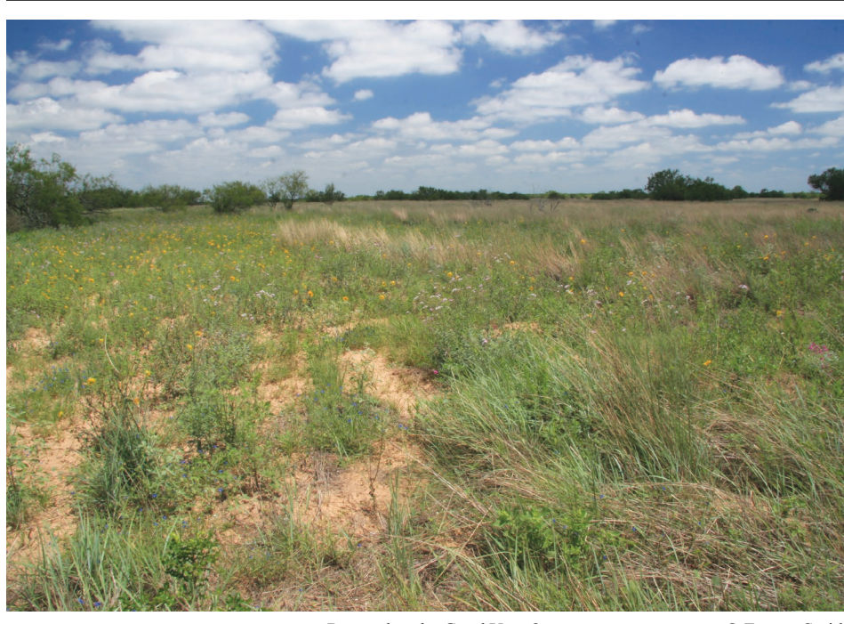
Remember the Good Years?