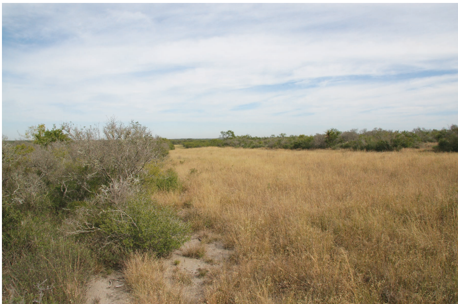
Pipeline right-of-way restoration is a major source of demand for native seeds.

projects, notably for quail, but also, increasingly to benefit pollinators and monarchs. Native seed mixes for range restoration in South Texas are desired, though use of cheaper non-native grasses, namely buffelgrass and Kleingrass, remains an obstacle. Finally, use of native seeds by the Texas Department of Transportation (TxDOT) is a steady source of year-to-year demand in South Texas.