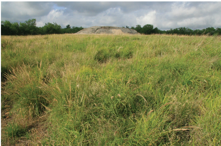
Successful restoration of a pad site around an active production well.