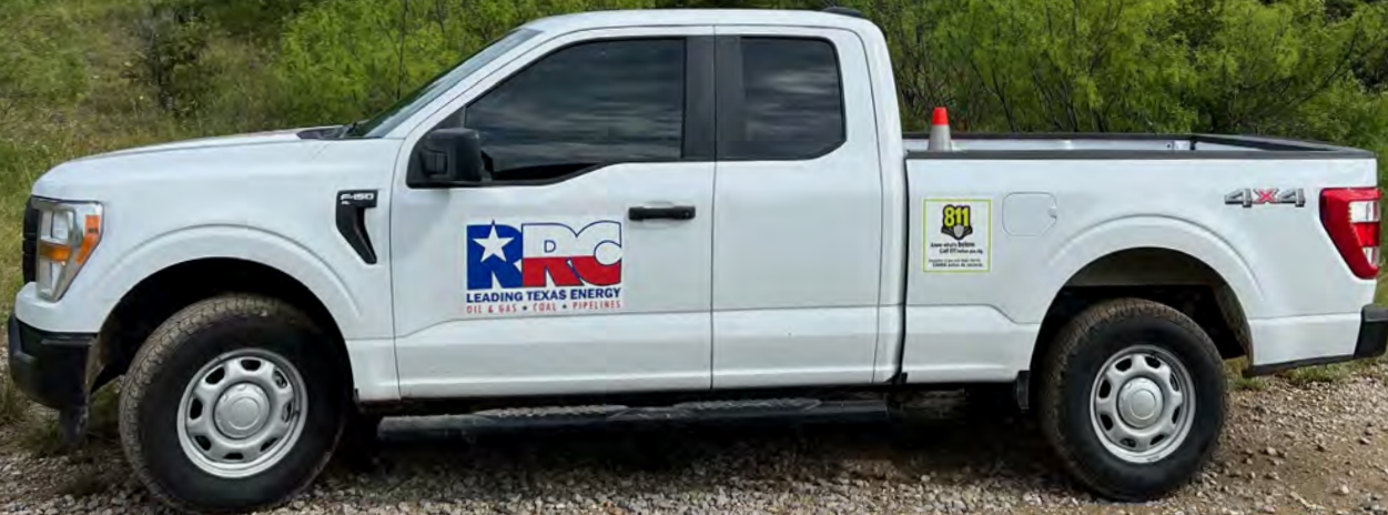
From the Field Photo Lease verification in Jack County