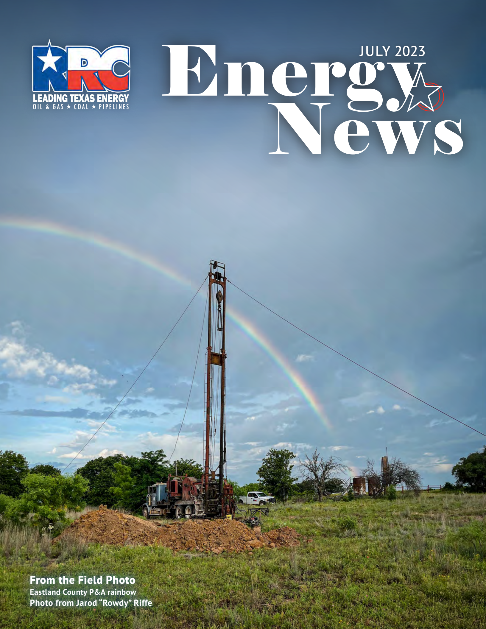
From the Field Photo Eastland County P&A rainbow