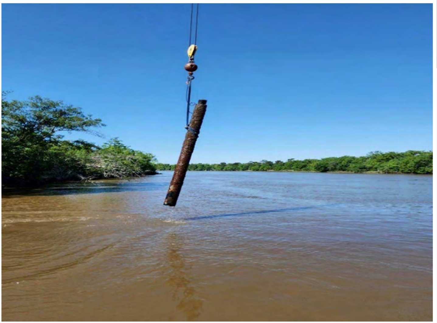
Work and removal of surface casings

The NPS contacted the RRC to oversee the project which took about two and a half months to complete. Contractors, including divers, worked in the water removing river debris and cutting the casings at the riverbed to get them removed.