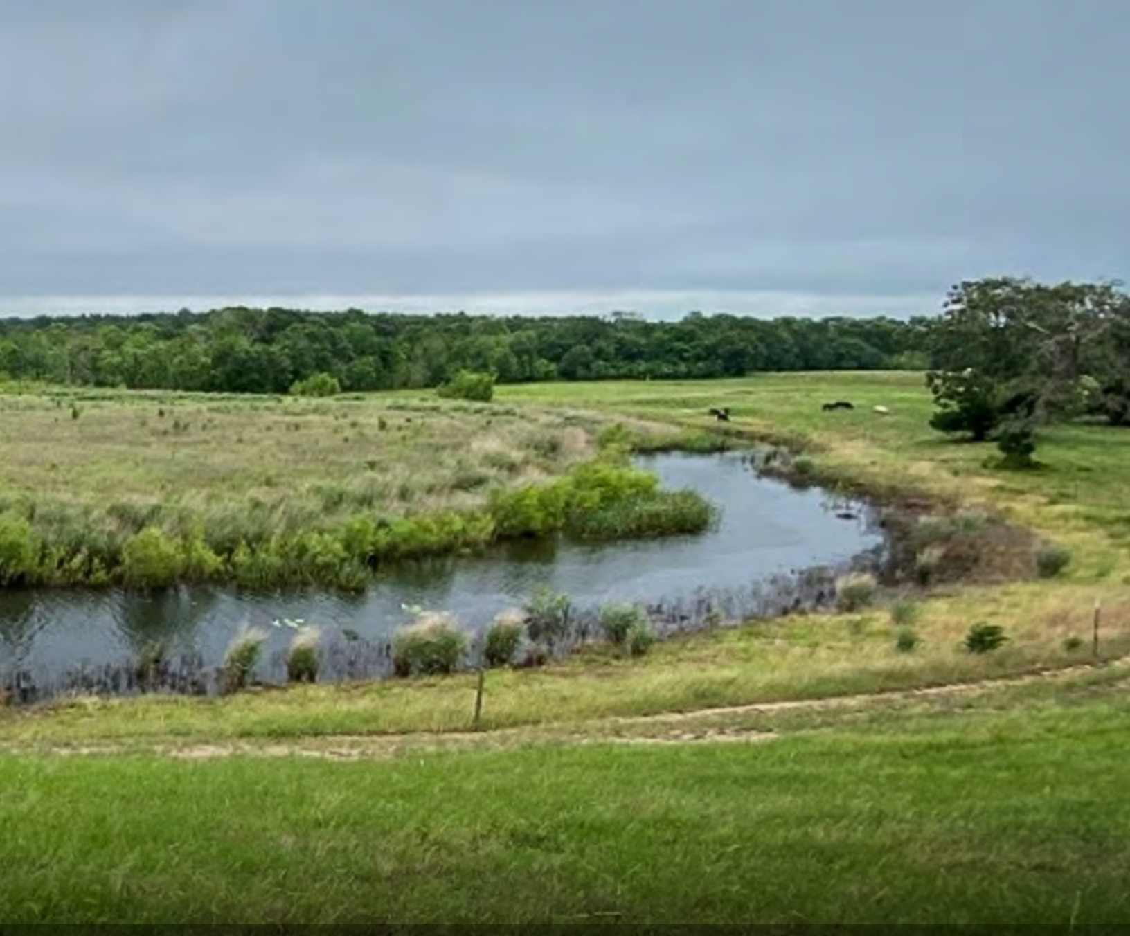
Pond SP-50 Islands

In 2016, a decision was made to convert the waste piles left on the area into islands with wetland wildlife enhancement features. Channels were excavated to separate the waste piles from the banks of the pond, leaving them as islands. The soils of the waste piles were improved to create suitable plant growth material by liming, fertilizing, and deep aeration.