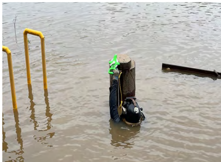
Diver working on surface casing