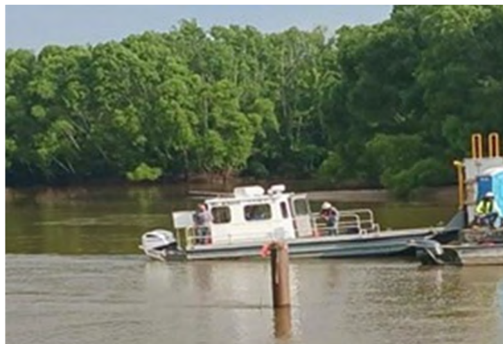
Work and removal of surface casings