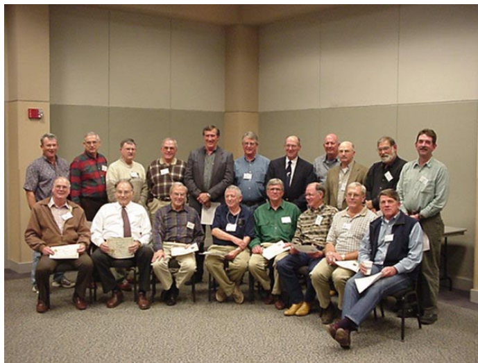
Charter members of the TCAFS were recognized during the 2001 annual meeting at San Marcos. 2001 was the twenty-fifth anniversary of the Chapter.

The meeting adjourned at 11:25 a.m. on January 24, 2001.