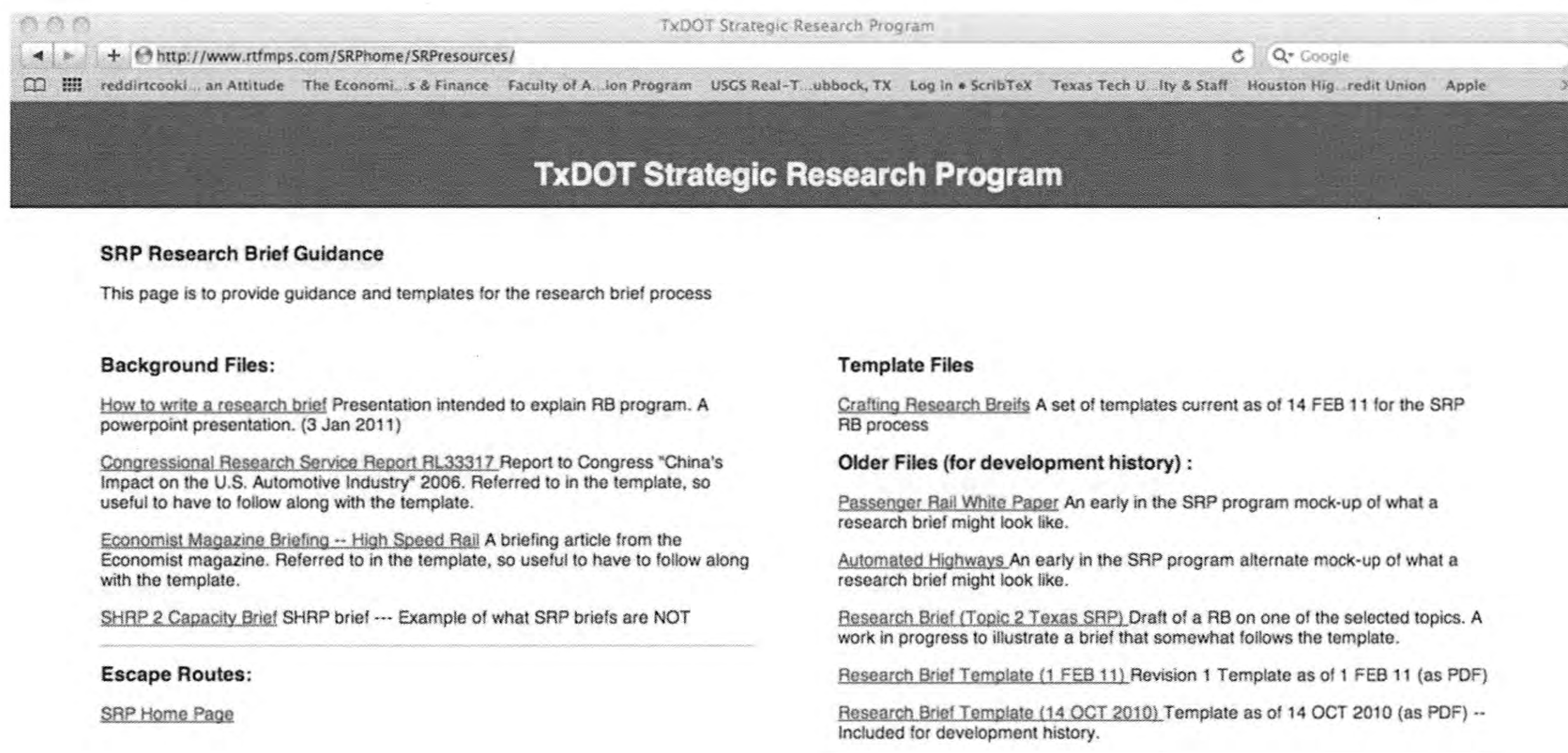
Figure 1.1: SRP research brief web page ( http://www.rtfmps.com/SRPhome/SRPresources/ )

FY 2011: Texas Tech formalized the RB structure and published writing guidelines, referencing guidelines, and two example briefs. These materials are currently located online, as Figure 1.1 indicates. All the website activities are to be absorbed into the RTI website and managed by TSD. The URL is active but non-persistent, and will be disabled upon notification by RTI.