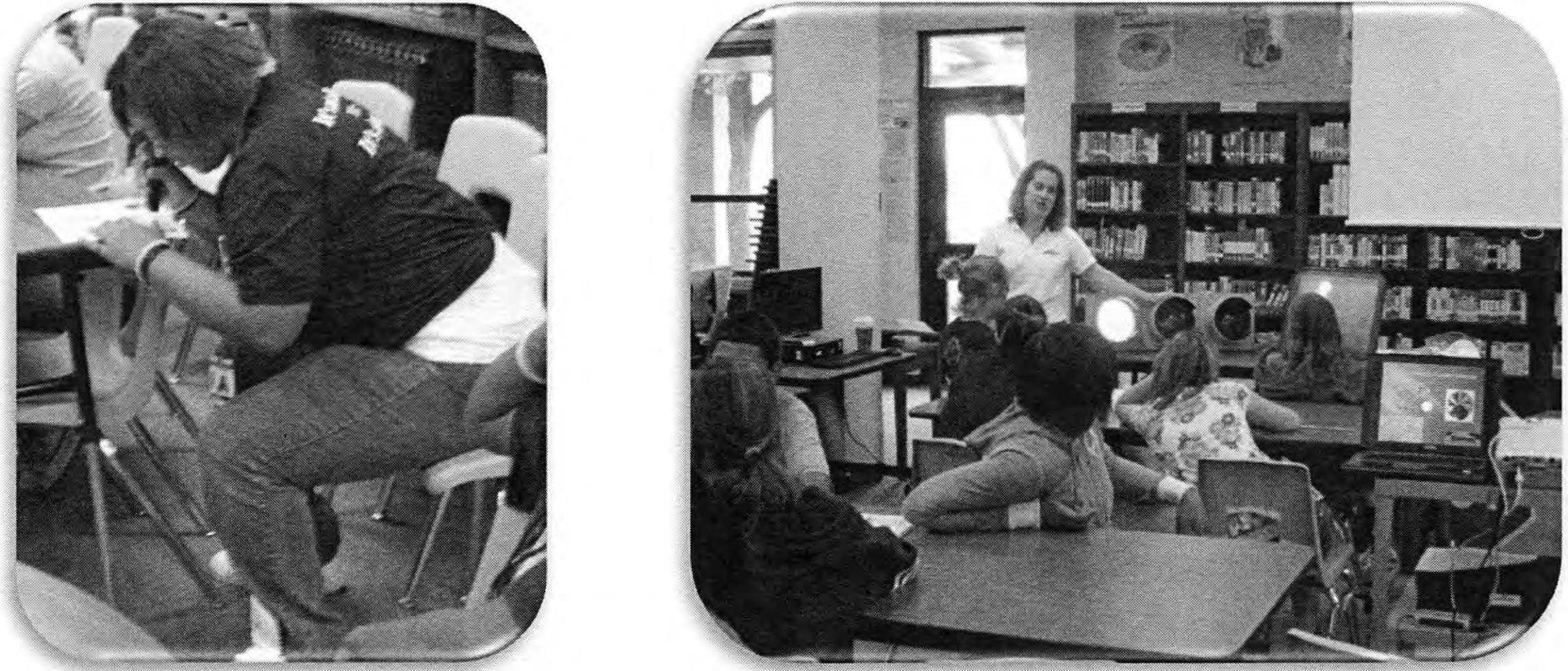
Figure 3. Up Close with the World of Transportation Gadgets Activity.

Students also looked at a traffic cone, warning light, and portable rumble strip. The TTI researcher also explained how traffic and pedestrian signals work. Figure 3 shows AVID students during the Up Close with the World of Transportation Gadgets activity.