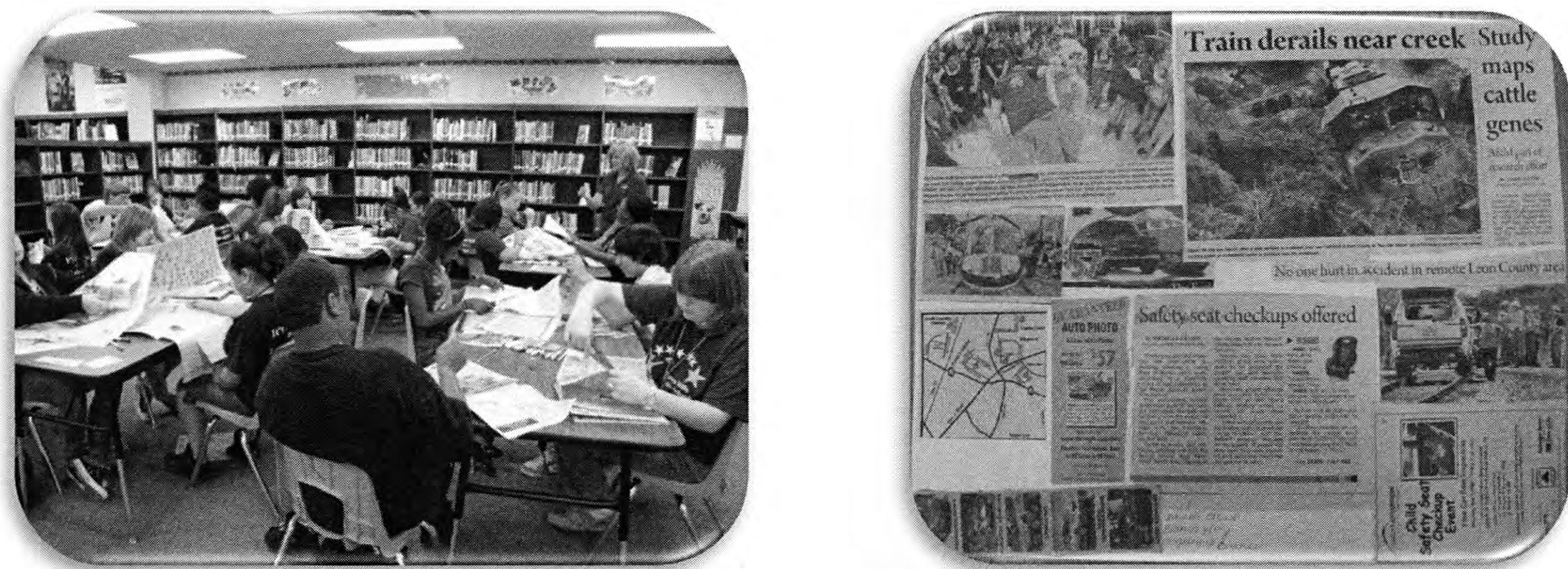
Figure 2. Transportation in the News Activity.

For this activity, team members placed students into small groups (two to four students per group). A TTI researcher then provided each group with newspapers and supplies (scissors, glue, highlighters, markers, and 14-inch by 17-inch drawing pads) to create “Transportation in the News” posters. Students were instructed to find as many articles as they could that involved any aspect of transportation, clip each article, and glue the clippings on the paper provided. Students were also encouraged to use highlighters to underline words and phrases in each clipping that were about transportation and to use markers to decorate their poster. At the end of this activity, the TTI researcher reviewed and discussed each groups’ findings. Figure 2 shows AVID students identifying transportation related articles in newspapers, and one group’s poster. Appendix C contains the instructions for Transportation in the News activity.