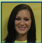
Tabitha Holman Center $500,000,000 Extreme Cash Blast $25,000