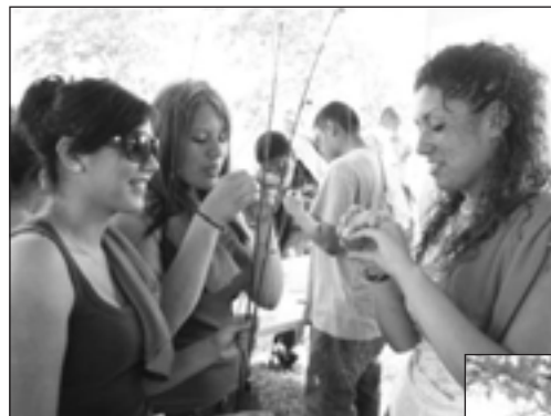
Teamwork makes rigging easy.