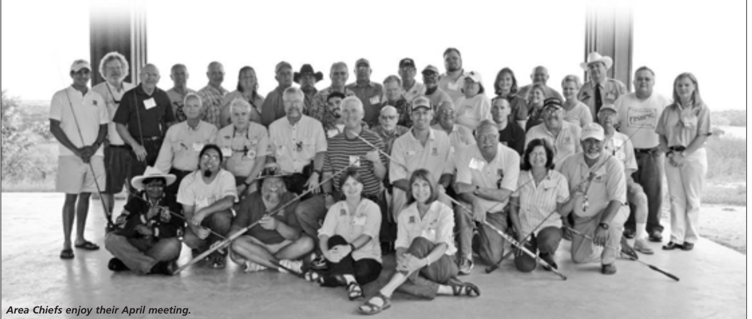
Area Chiefs enjoy their April meeting.