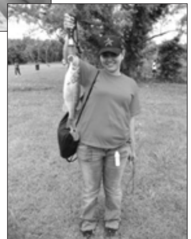
A proud angler displays her catch.