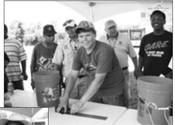
Every little bit counts when you measure fish.