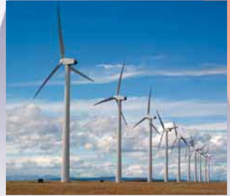
Rapid growth in the energy industry creates both pros and cons for the state.

The expansion of the Panama Canal promises implications for global shipping patterns, including those influencing Texas ports. By any measure, those ports are critically important to the Texas economy, accounting for nearly 1.4 million jobs and more than $82 billion in personal income each year. The Texas Department of Transportation (TxDOT) formed the Panama Canal Working Group in 2012 and sponsored a research study conducted by TTI to assess opportunities associated with the canal expansion, particularly the potential impacts on ports and landside infrastructure, including roadways, railroads and intermodal facilities. TTI examined previous studies on the canal expansion and heard from shippers, ports, carriers, industry groups and other stakeholders at a series of meetings. The overarching finding from the study is that the Panama Canal expansion — coupled with continued population growth in Texas, energy-sector developments and the emergence of new trading partners throughout the world — represents opportunities to expand Texas' position as a global gateway for the nation. By providing a low-cost, reliable, safe, secure, multimodal and environmentally sustainable supply chain, the state can increase its global trade, create new jobs, and expand the state and national economies. ■