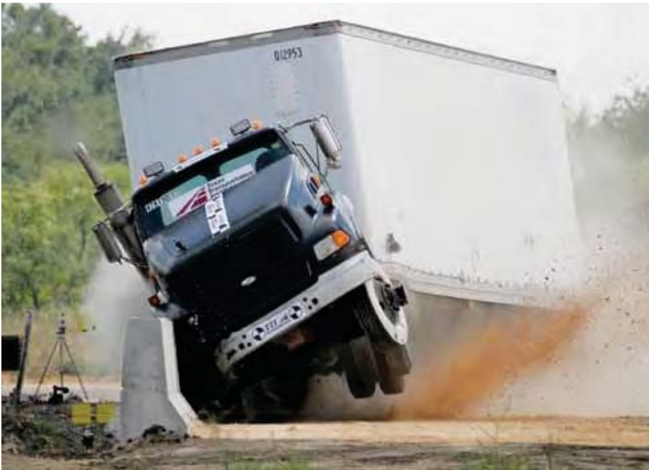
An 18-wheeler crashes into a concrete barrier at TTI's Proving Grounds. For the first time, the test was streamed live via the Internet for clients across the country.

On Sept. 26, 2012, at the Texas A&M Transportation Institute's (TTI's) Riverside Campus crash facility, a fully loaded 18-wheeler traveling at 50 mph slammed into a concrete barrier placed on top of a retaining wall. The data from the unique crash test will prove vital for increasing safety and decreasing construction costs for this type of barrier application. The test was broadcast across the country via the Internet as a first-ever streaming event.