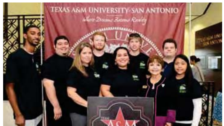
A few of the members of the UDS leadership team from TAMU-SA and UIW.

TTI developed UDS and provides the science, materials and support for the program, while each student group determines how the program will work in its school. Funding is provided by the National Highway Traffic Safety Administration.