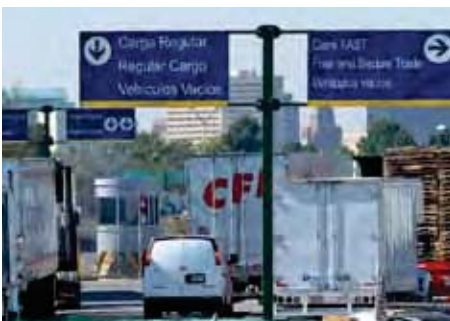
Efficient border crossings are essential to the El Paso region's economic prosperity.