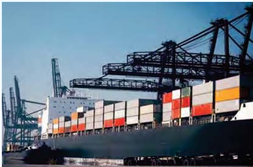
Moving freight via U.S. waterways is being reevaluated as a cost-effective alternative to congested roadways.

Kruse's findings make it clear that in most instances marine highway shippers and operators are not currently cost competitive with existing alternatives. "There will be no major development of a marine highway system until the overall framework changes," Kruse states.