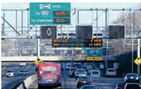
Implementing innovative ideas, like the HOV facilities in Minnesota pictured here, improved mobility dramatically in the United States.

This is a comprehensive, user-friendly guide that covers almost every topic pertaining to high-occupancy vehicle facilities — policy considerations, planning, designing, marketing, implementing, operating and enforcing. The largest report ever published at the time, this 4-inch-tall three-ring binder (now available online at http://trid.trb.org/view.aspx?id=540319 ) still serves as the resource recommended for planners, engineers, marketing specialists, transit operators and police responsible for all aspects of HOV facilities. ■