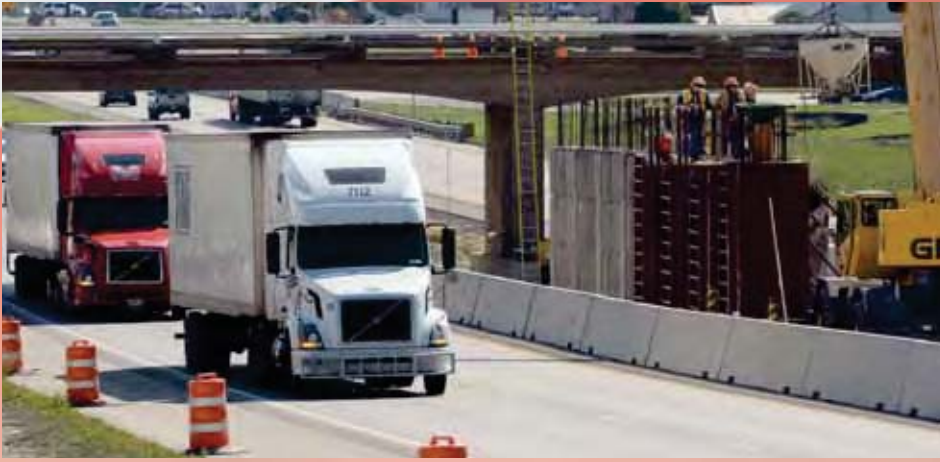
Travelers, shippers and businesses are the focus of My 35 communication efforts.