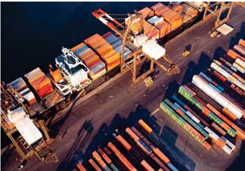
Officials are positioning Texas to capitalize on the Panama Canal expansion.

It's hard to overstate the energy sector's impact in Texas. The industry directly employs nearly 225,000 Texans in oil and gas exploration and production, accounting for almost 13 percent of all new jobs added in the state over the past year. The rapid growth of wind-power generation has further bolstered the energy sector's contributions. But impacts can also be negative. Countless trucks carrying construction materials, heavy equipment, fracking water, petroleum products and other supplies strain roadways literally to the breaking point, necessitating extensive and expensive pavement repairs. Many truckloads are overweight, further exacerbating the problem. TTI researchers have worked with TxDOT to measure and project the impact of this wear and tear, which TxDOT estimates at roughly $2 billion per year for state and county road systems. TTI recommendations included donation agreements with energy companies, procedural changes related to early notification of development activity, and better coordination of road maintenance and repair. ■