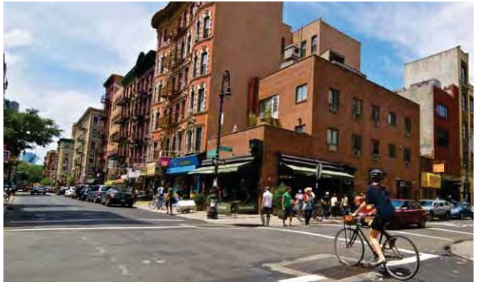
NCHRP Report 708 provides users with an easy approach to meeting their self-defined goals to help progress toward a sustainable transportation system, contributing to economic and community vitality while also improving safety, air quality and reliability.