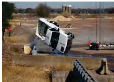
NCHRP Report 350 was the standard for crash testing for 16 years, providing a wider range of test procedures and including a 3/4-ton pickup in place of the 4,500-pound passenger car.