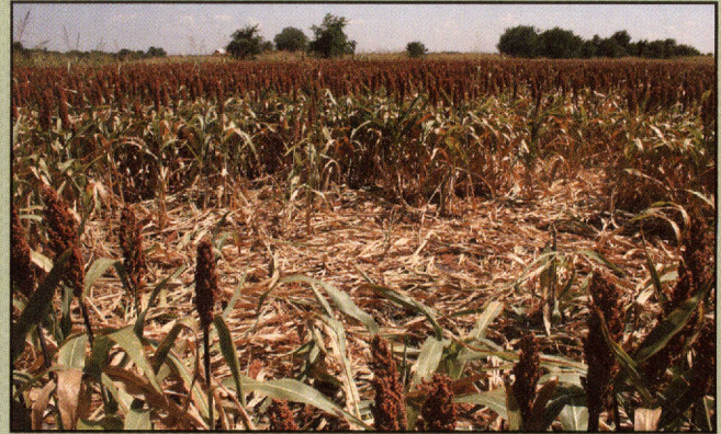
Feral hog damage to sorghum caused by both trampling and foraging.

feral hog tracks appear more rounded (Fig. 4).