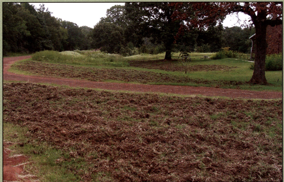
Feral hogs can cause damage to rural pastures and urban landscapes alike.

disturbs vegetation and soil extensively, the type and abundance of plants there can shift. Rooting damages lawns, gardens, hay pastures, and native range (Fig. 1). It can also reduce the number of plant species in an area.