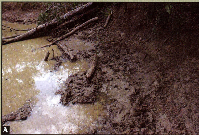
Wallows (A) can be found in wet areas during warmer months, and rubs are often associated with them.