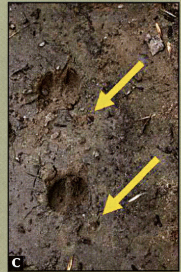
Circular shape of a feral hog track (A). Note the dewclaw mark on the bottom left. When visible in the tracks, hog dewclaws typically register wider than the hoof. Both dewclaws may not register, depending on the soil type and animal movement. In deer tracks (B), the dewclaws typically do not register wider than the hoof. Compare again with front and hind tracks of a feral hog (C). Notice the round shape, blunted toes, and wide dewclaw marks.

both plant and animal matter, and their diet varies by location and season. For these reasons, feral hog droppings take many forms, which can make identification difficult.