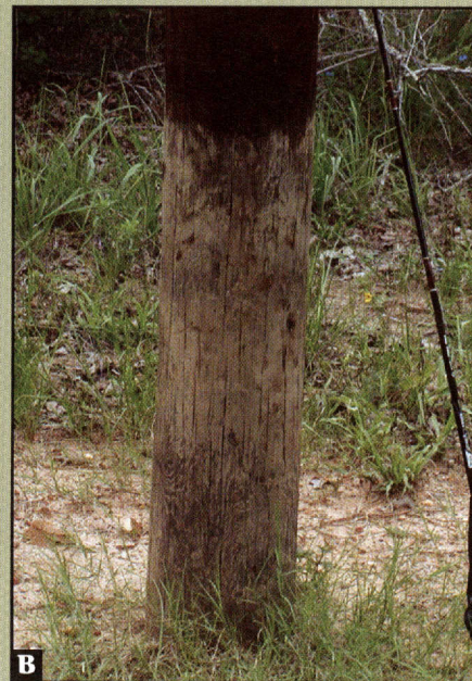
In areas where populations are large, feral hog rubs can often be found on utility poles (B).