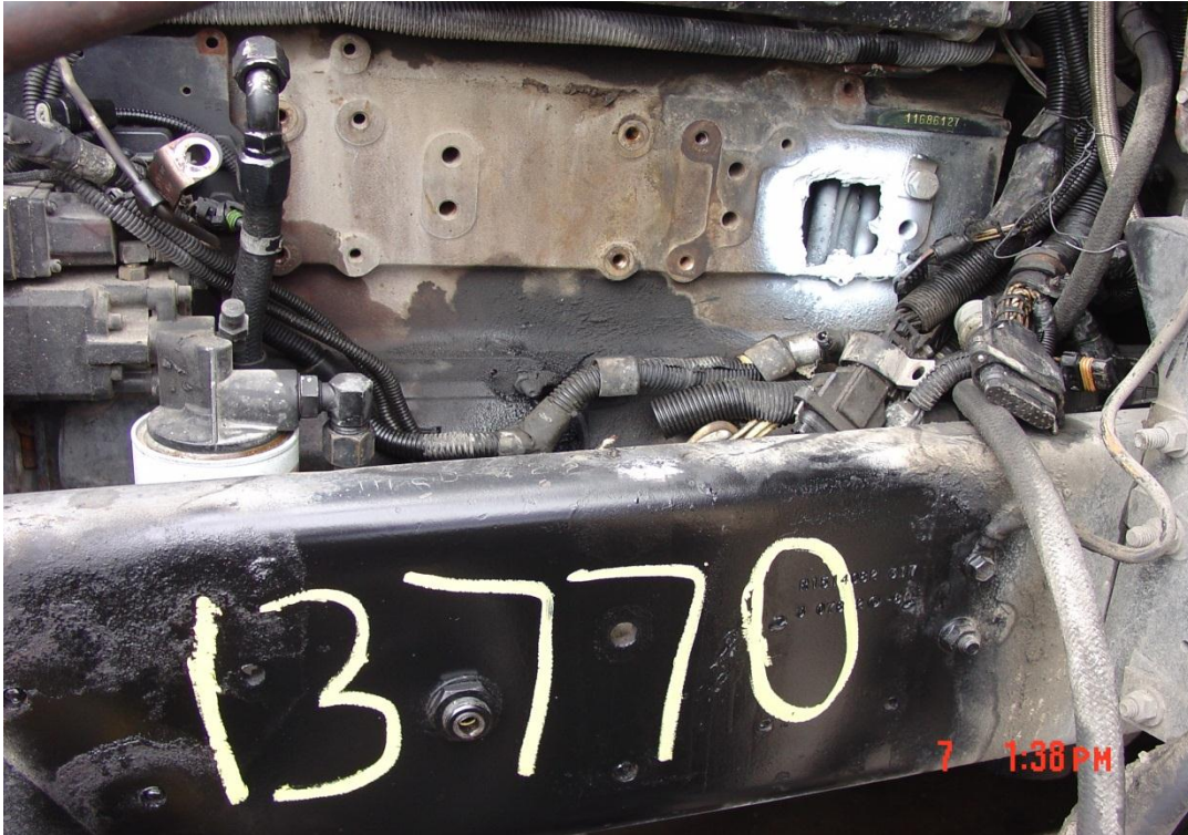
Figure 4. Mid-range view of one of the 3-inch holes in the engine. Two holes are required— one on each side of the engine.