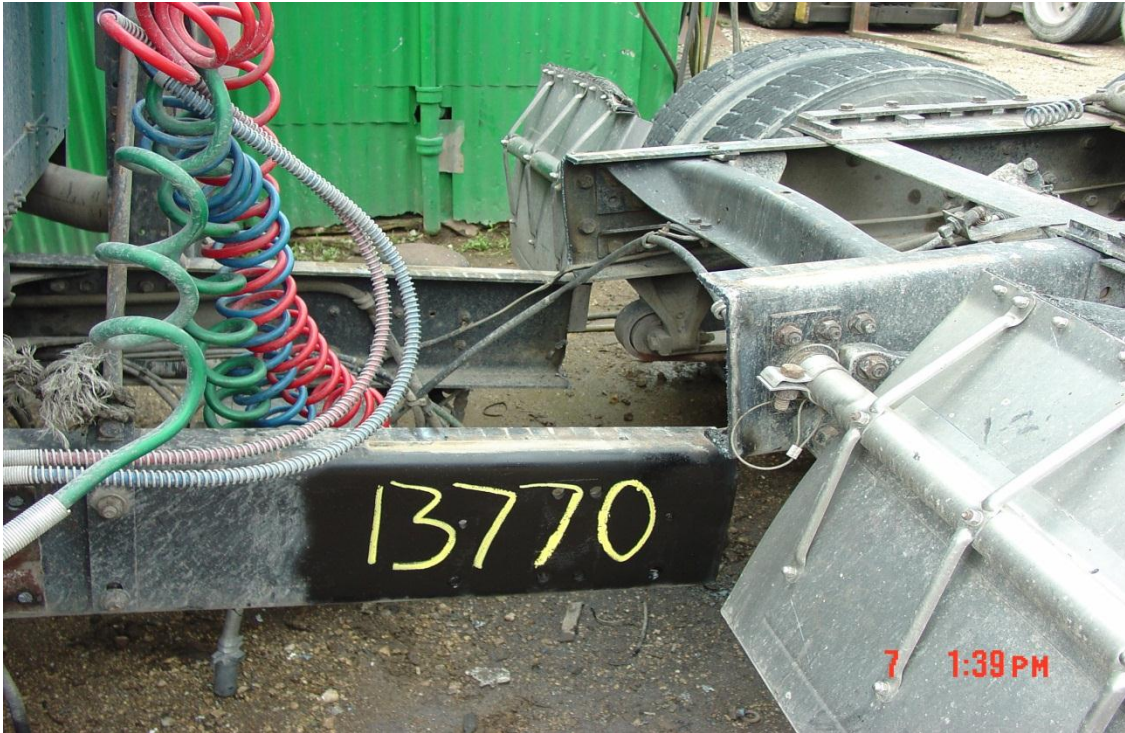
Figure 2. Close-up of the truck frame cut on both sides.