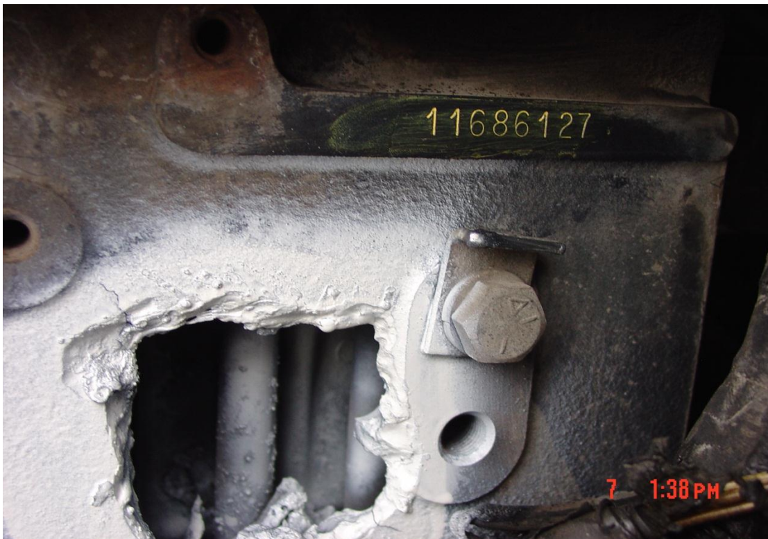
Figure 3. Close-up of the engine hole next to the engine serial number. This picture shows only one of the two required holes—one on each side of the engine.