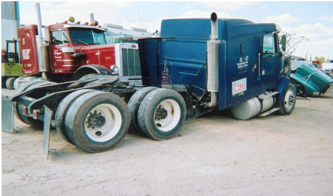
Figure 1b. Truck frame cut behind the cab (second view).

Note: In the printed version of this publication, these photos will be in black and white. In the online version, they will be in color.