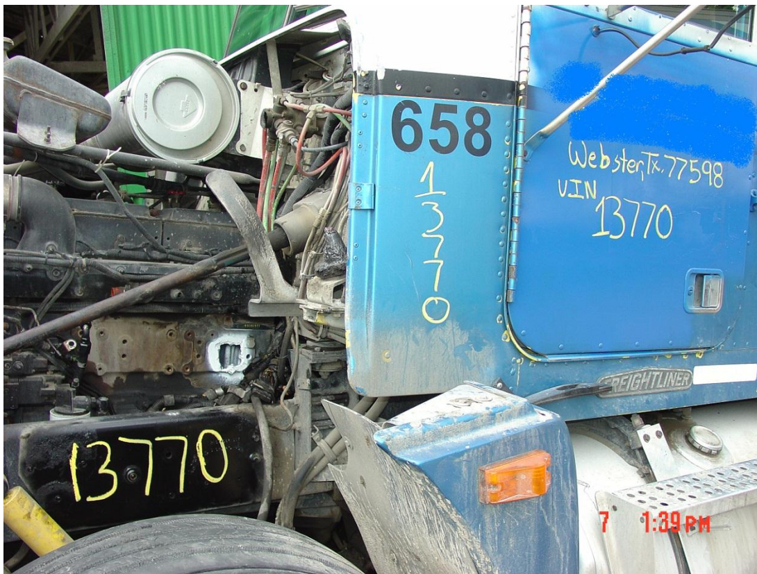
Figure 5. One of the required two holes in the engine block seen from a distance.