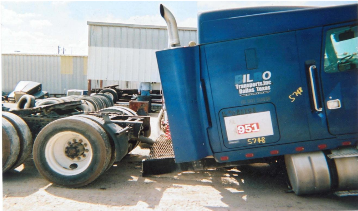
Figure 1a. Truck frame cut behind the cab.