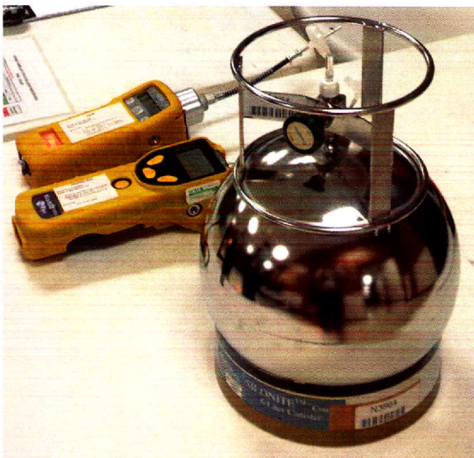
A summa canister like those TCEQ uses to take air samples in environmental investigations.