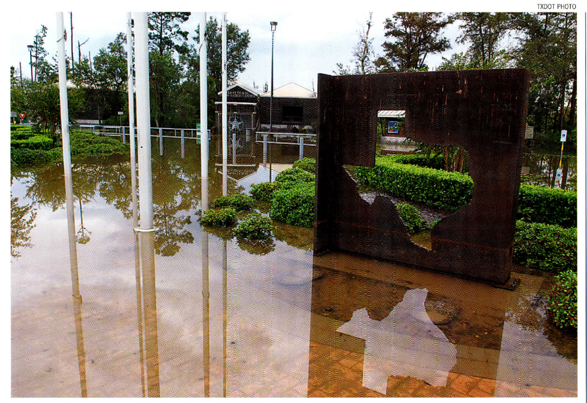
Flood waters from Hurricane like temporarily blocked access to Texas Department of Transportation's Texas Travel Information Center in Orange.