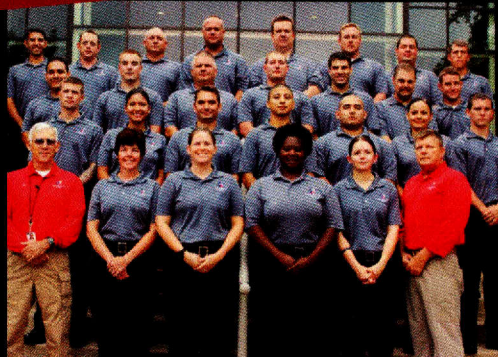
CAPCOG Regional Law Enforcement Academy's Basic Peace Officer Class No. 69 will graduate Sept. 20, 2013, in a ceremony at the Texas State Capitol. Explore upcoming cadet and in-service education at training.capcog.org .

Get the meeting and hearing dates at CAPCOG's website.