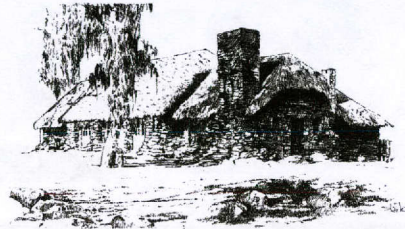
Civilian Conservation Corps (CCC) Refectory Many CCC structures still exist in the park. Please observe these with respect and admiration.

Flash Flooding Caution With no containment dam upstream, the river at this point is wild, untamed and subject to intense flash flooding. Be prepared to evacuate the park during advance notice.